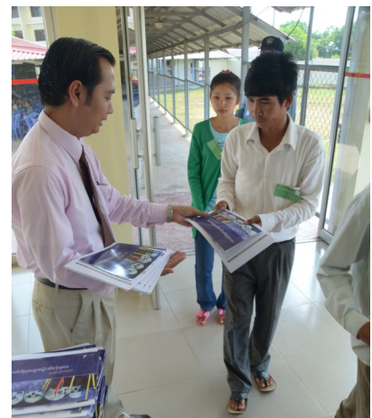
PAS distribute informative materials to visitors of the ECCC