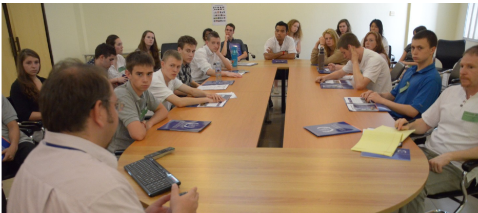
American students visiting the court attend a briefing and Q&A session held by Public Affairs staff