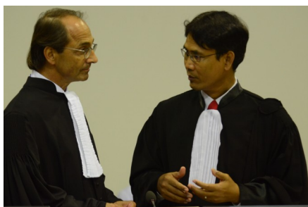
Defense counsels confer with each other in the Trial Chamber