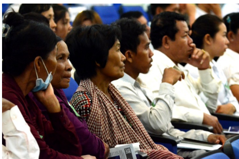
Cambodian citizens visited the court and viewed Case 002 hearings in April.