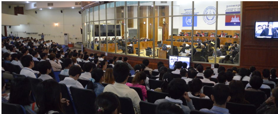
The public gallery of the court allows villagers, students, NGO workers and other s a chance to see the court in action as hearings continue in Case 002.

In April, the chamber continued examining the administrative and communications structures of the Communist Party of Kampuchea and some aspects of the roles of the accused.