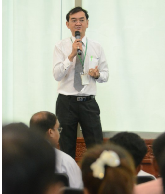
A Public Affairs representative briefs visitors on the work of the court