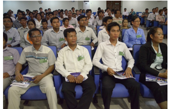
Cambodian villagers learn about the trials and attend a hearing via the ECCC Study Tour program