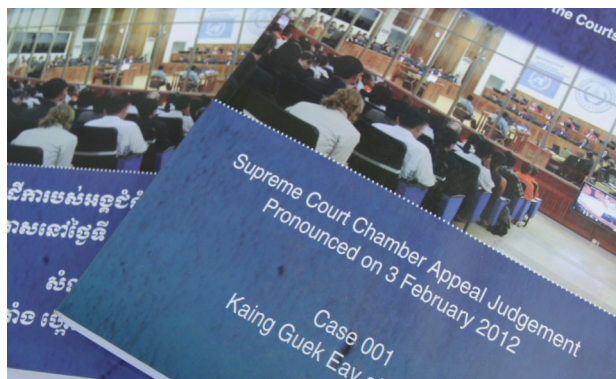
The full appeal judgement in Khmer and English

It provides more insights over why the Supreme Court Chamber entered separate convictions for the crimes against humanity of extermination, enslavement, imprisonment, torture and other inhumane acts, granting in part the Co-Prosecutors' appeal. It also explains reasons behind why 10 individual appellants, whose applications for a Civil Party status were rejected by the Trial Chamber, were now admitted as Civil Parties in the