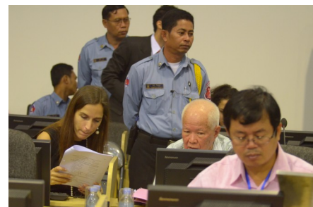
Defendant Khieu Samphan speaks with counsel during Case 002 hearings

Editor's note: The Trial Monitoring section with summaries of the proceedings is put on hold until further notice. Transcripts of the public hearings are available on the ECCC website at: www.eccc.gov.kh/en/Case002-Transcripts/en .