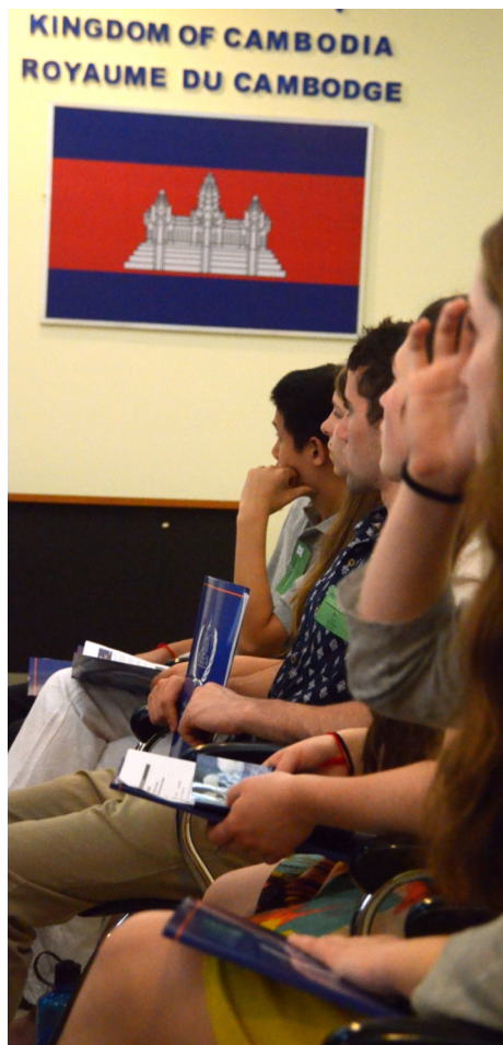
American high school students watch a presentation on the work of the ECCC

For more information, please contact pas@eccc.gov.kh