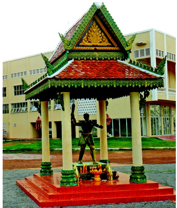
The Lord of the Iron Staff— the ECCC's guardian spirit statue