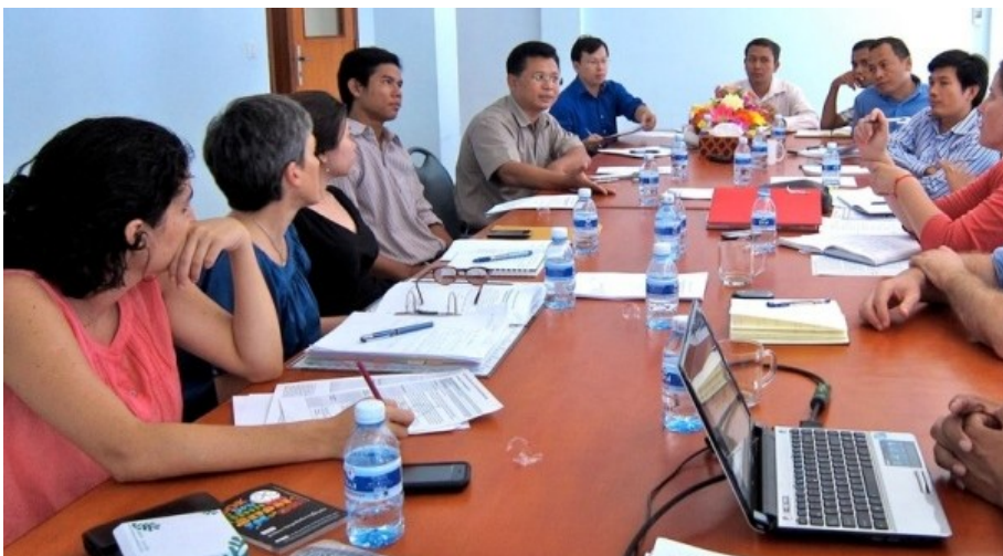
Participants of the Reparation and Non-Judicial Measure Team of the VSS Sub-Working Group