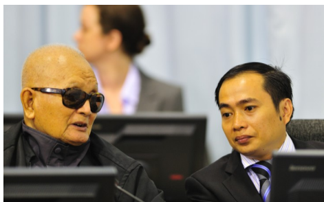
Defendant Nuon Chea speaks with counsel during hearings in Case 002