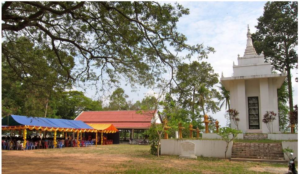
Inauguration ceremony at Krang Ta Chan memorial site

Many victims and Civil Parties cite the education of the post-war generation about