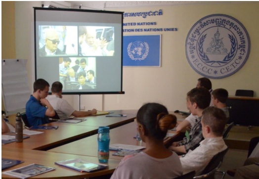
International students watch a video on the work of the ECCC

The ECCC regularly welcomes visitors to the court as part of its ongoing outreach efforts, intended to educate the wider public about the history of the Khmer Rouge period, the work of the court, and the progress of cases. In the month of April, both Cambodian and international visitors received briefings from staff, tours of the court, and the chance to sit in on hearings in Case 002.