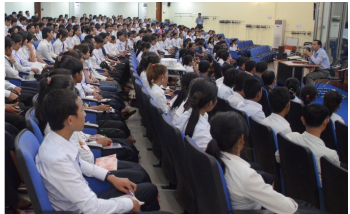
Students from Siem Reap province visiting the court.

May/July 2012: ADHOC hosts the fifth round of Civil Party District Meetings in various provinces to update CPs about recent developments in Case 002