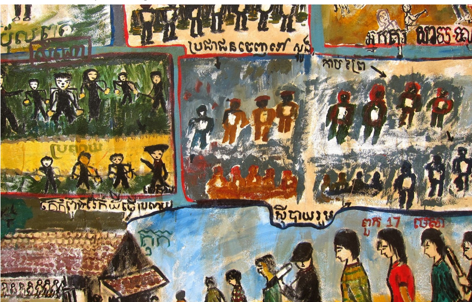
A mural of artworks by local children that depict the events of Krang Ta Chan during the Khmer Rouge era

The local community also raised considerable funds to realize the project. These funds were complemented by the support of the Institut für Auslandsbeziehungen (IFA) and Gesellschaft für Internationale Zusammenarbeit (GIZ), Germany.