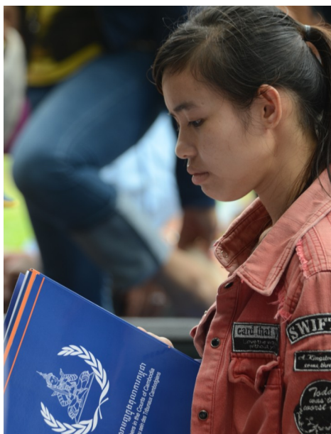
Public forum attendee reads through court materials.

Since the commencement of the opening statements in Case 002 on 21 November 2011, the Trial Chamber has concluded 87 trial days, where a total of 20 witnesses, experts and Civil Parties have testified. As of 31 July, a total of 48,100 persons have attended the trial hearings in Case 002, amongst which about 80% were Cambodian nationals brought to the court by the ECCC's free transportation services.