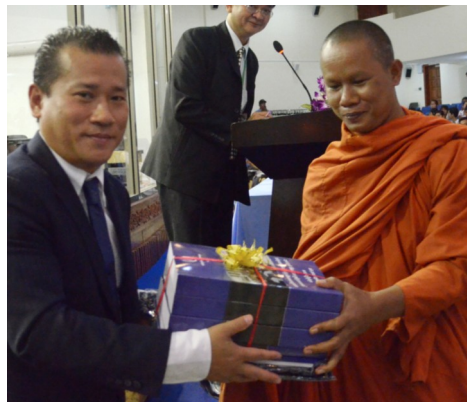
Appeal Judgment books in Case 001 are distributed at ECCC.