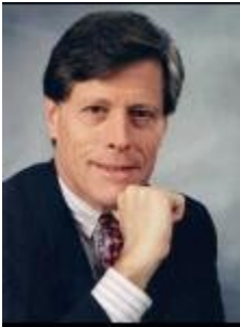
American appointee Mark Harmon.

A veteran American prosecutor in international criminal justice will assume the role of judicial investigator for the two remaining cases at the Extraordinary Chambers in the Courts of Cambodia, the court announced on 30 July.