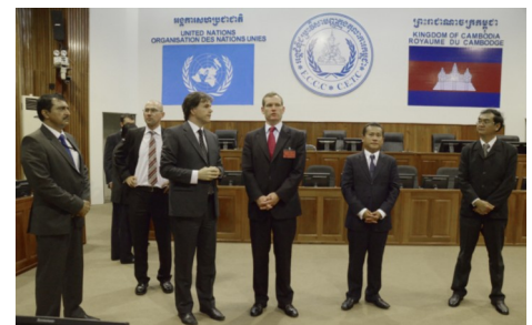
UK Minister Jeremy Browne tours the ECCC courtroom.

The ECCC has so far received nearly US $7 million in financial donations from the United Kingdom. Mr. Browne's visit to the court demonstrates the United Kingdom's continued support and commitment to the ECCC's mission to seek justice for the Cambodian people for crimes committed during the Democratic Kampuchea regime, during which at least 1.7 million Cambodians are believed to have lost their lives.