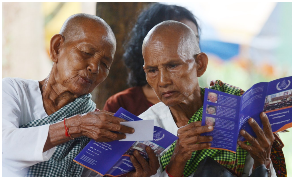
Community members in Anglong Veng read ECCC pamphlets.