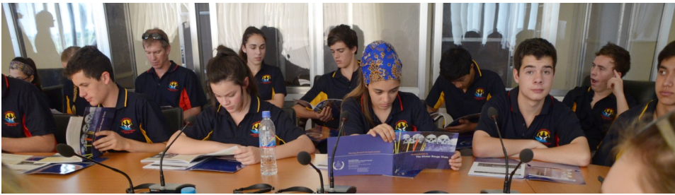
Visiting students preparing to act out different court roles.

On 2 July, high school students from St. Ignatius College in South Australia participated in a role-playing simulation of the judicial court process. Students acted out court arguments as though they were the prosecution, defence, civil parties, or judges. The school's visit was the second time in two years students visited the ECCC as part of a three week social justice awareness tour of Vietnam and Cambodia.