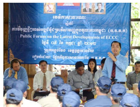
ECCC representative speaks to assembled crowd.

The Public Affairs Section has held similar forums in Pailin and Samlout in the province of Battambang, both former Khmer Rouge strongholds. Villagers in these areas have also participated in the ECCC study tours, visiting the court and touring other historical sites. So far, more than 150,000 people from all over the country have visited or observed proceedings at the ECCC in person.