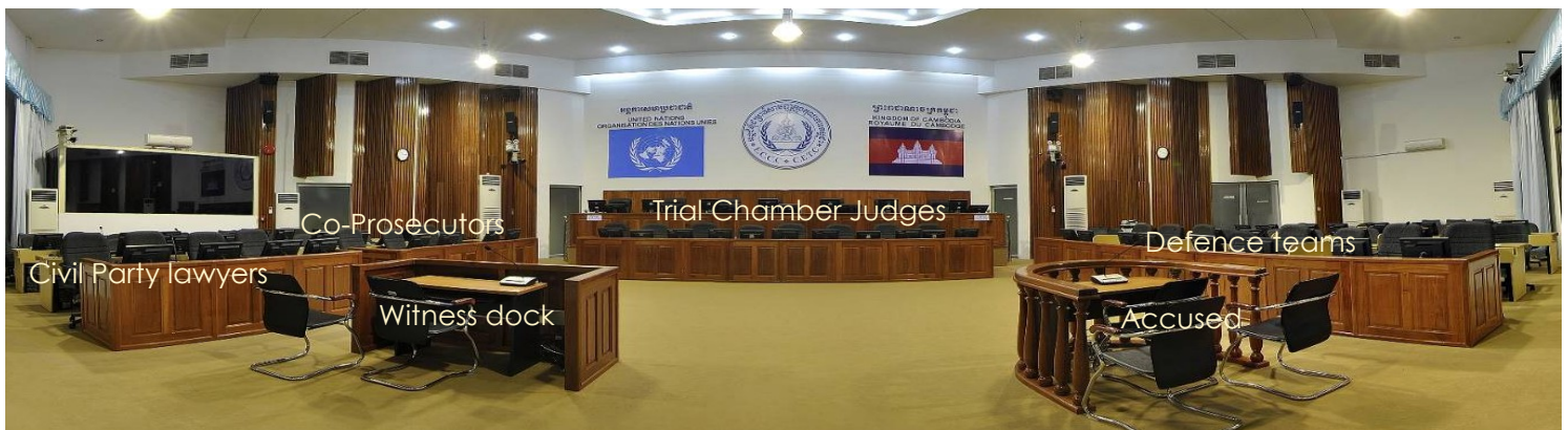
A panoramic view of the main courtroom in the Extraordinary Chambers in the Courts of Cambodia.

In consideration of Judge Motoo Noguchi's 16 May 2012 resignation that takes effect on 15 July 2012 and the Chamber's desire to ensure the full functionality of the Chamber in accordance with the principles of fair and expeditious conduct of proceedings, as of 15 July 2012 the Supreme Court Chamber's President designates Reserve Judge Florence N. Mumba to sit in place of Judge Motoo Noguchi. Reserve Judge Florence N. Mumba will replace Judge Motoo Noguchi in the Supreme Court Chamber in all proceedings, until a regular judge is appointed.