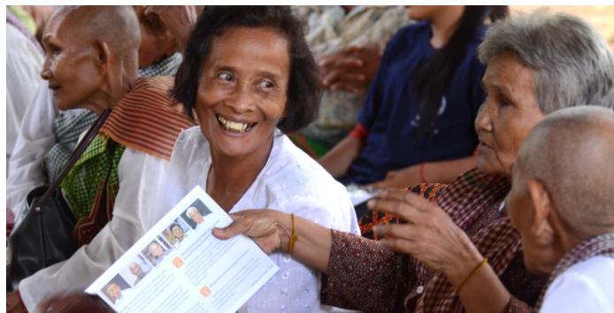
Villagers chat at the ECCC public forum in Anlong Veng.

28 August: CDP holds a national call-in radio show for callers to ask questions and share their experiences.