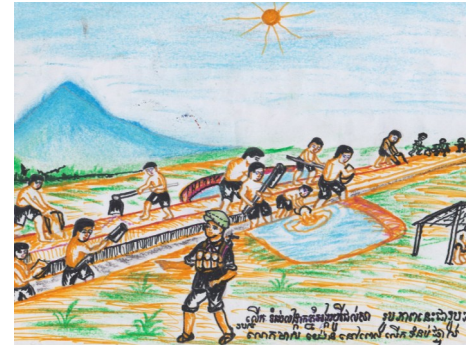
A drawing of the Khmer Rouge made by a villager for a local history book.

The memory initiatives have also provided a method to teach a more personal history of the Khmer Rouge era to the next generation. A committee member said, "I realized that making this kind of documentation for