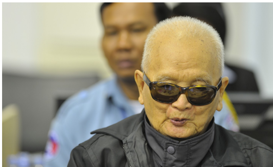
Defendants Nuon Chea in the ECCC courtroom. Defendant Ieng Sary (not pictured) has been observing the proceedings from the holding cells due to health concerns.

On 20 July 2012, the international legal officer met with Civil Party victims of severe torture who took part in a meeting facilitated by the Transcultural Psychosocial Organization in order to update them on the proceedings and answer their questions.