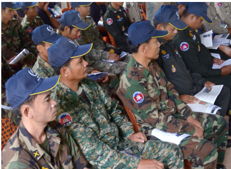
Soldiers listen to ECCC representatives during the public forum in Anlong Veng.