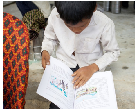
A young boy reads about the experiences of people in his community under the Khmer Rouge.

our village is important—for example, my nephew learned about the history of the local dam. When he saw the cover of the book, he was surprised because that place is near his house, and he had no idea that people died making that dam."