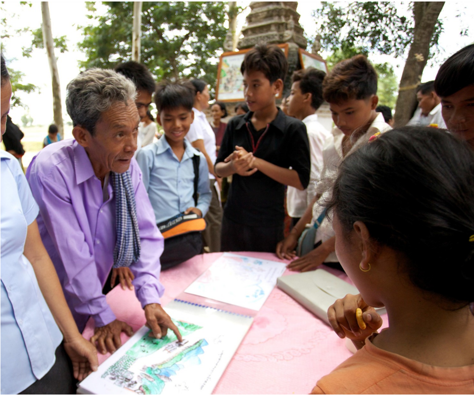
As part of the ICfC's Community Memory Initiative, an elder in Kampong Speu uses drawings to speak about his experiences living through Democratic Kampuchea.

In July, the International Center for Conciliation–Cambodia (ICfC) launched the Community Memory Initiatives (CMI) project, which aims to assist villagers in strengthening community relations and empowering rural Cambodians to take charge of their own healing. The project encourages Cambodians to preserve their memories and experiences surrounding the history of the Khmer Rouge through community-led dialogues.