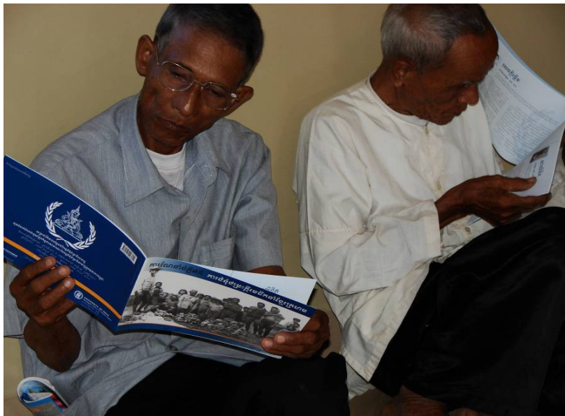
Outreach in Pursat (February 2009) and Svay Rieng (April 2009)