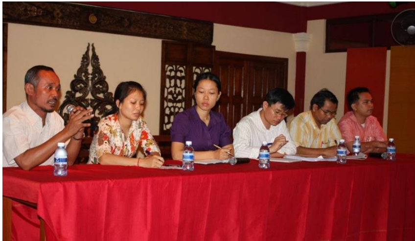
A presentation by Civil Party lawyers during the Civil Party meeting

On Saturday 28 March and Sunday 29 March, the Victims Unit organised its first Civil Party meeting before the Substantive Hearing. Civil Parties in Case 001 were invited to attend the meeting in order to guarantee that all Civil Parties have access to the same information before the Substantive Hearing. Civil Parties received financial support for transport, food and accommodation. In total, almost 80 of the 93 Civil Parties in Case 001 attended the meeting, with almost all of Cambodia’s provinces represented.