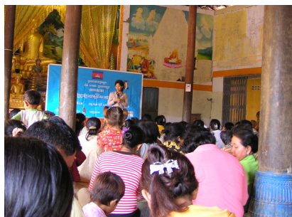
ADHOC outreach in Kampot

During March, over 4000 people attended ADHOC outreach sessions on the ECCC. These outreach meetings were held in 42 districts in every province of Cambodia and were funded by the European Union. Participants were drawn from local communities, and ranged from victims of the Khmer Rouge, ordinary local people, students, teachers, monks and community leaders. Participants heard from trained ADHOC facilitators about the ECCC, discussed the “Duch” trial, and their feelings about the ECCC process. Participants were also provided with detailed information, advice and assistance in lodging victim forms and civil party applications in order to participate in the trials. In April, ADHOC plans to reach a further 35 district communities to ensure that as many Cambodians as possible are informed and empowered with regard to the ECCC.