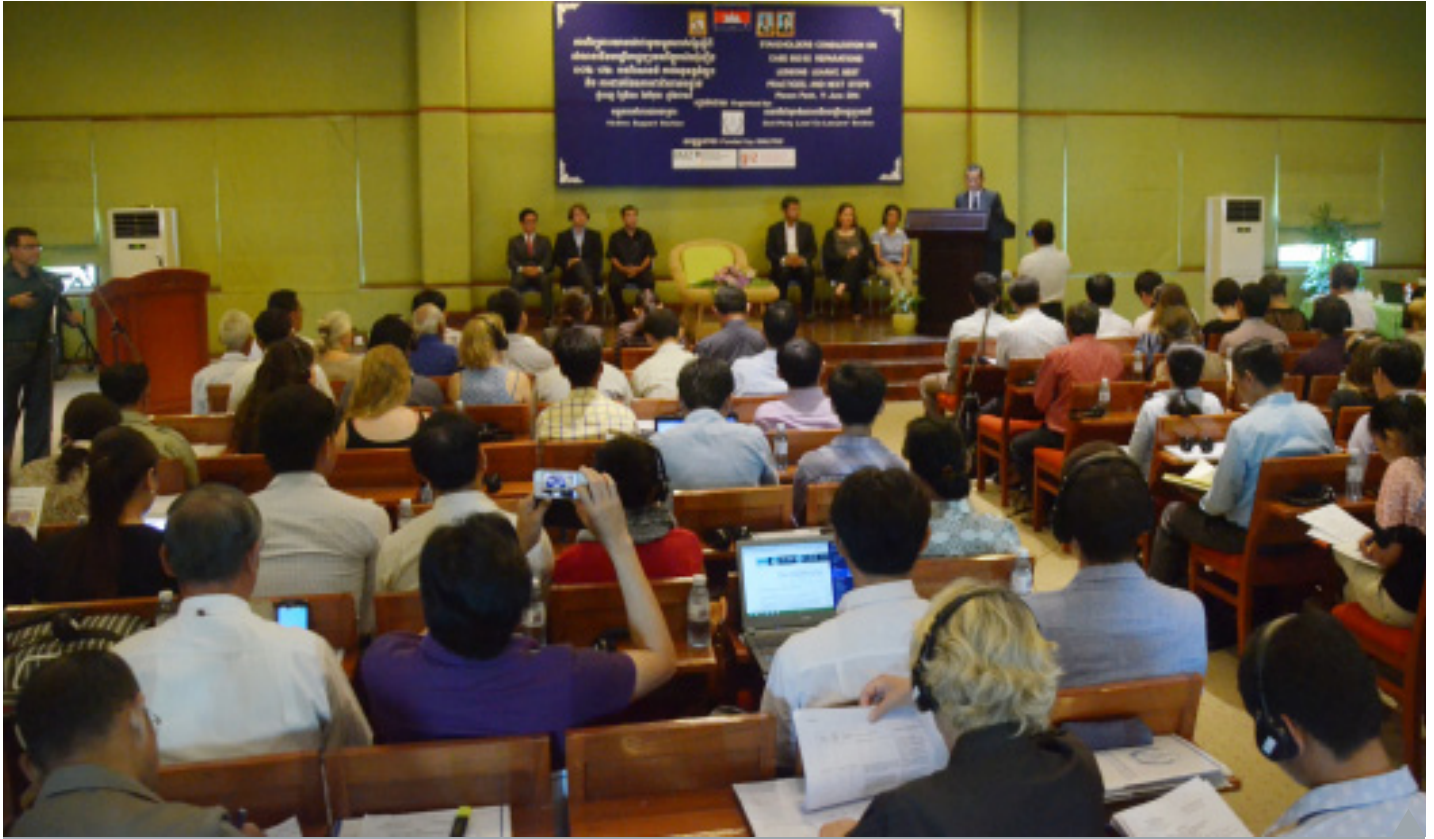
The Victims Support Section convenes a coordination meeting with its partners to discuss the implementation of reparation projects.

In Case 004, all Defence teams are furthering their attempts to gain access to their respective case files. One Defence team has filed a motion requesting the inclusion of its filings in the case file; at the moment the Office of the Co-Investigating Judges (OCIJ) has refused to do so. The same team has filed another motion with the OCIJ, inquiring as to the outcome of the case in the event of a split decision between the national and international Co-Investigating Judges, where one judge indicts the named suspect and the other dismisses the case.