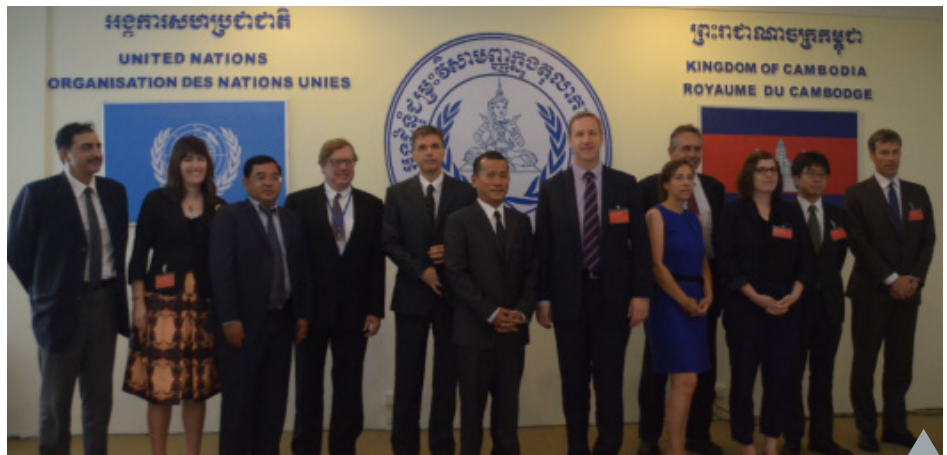
Group photo of representatives from the PDG and the ECCC management.

Important progress is being made. The trial verdict in the first phase of Case 002 against surviving senior leaders of the Khmer Rouge, to be delivered on 7 August, will represent a major milestone in the work of the ECCC. The next phase of the case will cover some of the most significant charges yet heard by the ECCC, including genocide and other grave crimes committed on a national scale. The Trial Chamber has scheduled an Initial Hearing for 30 July and evidentiary hearings are anticipated to start in the coming months. In Cases 003 and 004, judicial investigations continue in respect of a large number of significant crime sites. All this work is made possible by the ECCC’s dedicated and professional staff.