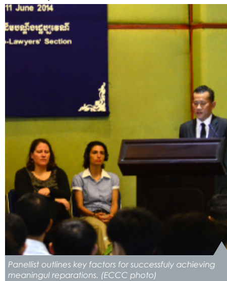
Panellist outlines key factors for successfully achieving meaningful reparations.

There were also opportunities for journalists, civil party lawyers, civil parties and civil society organizations to pose questions to the panellists regarding the reparation process and the planned outcome of reparations. The interactive dialogue sessions provided opportunities for stakeholders to discuss project concepts and their feasibility for inclusion in Case 002/02 reparation requests.