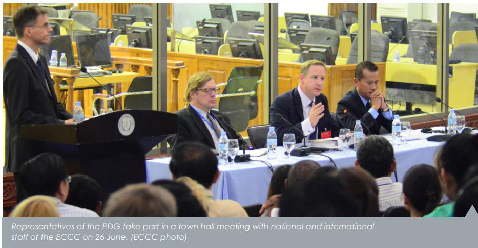
Representatives of the PDG take part in a town hall meeting with national and international staff of the ECCC on 26 June.