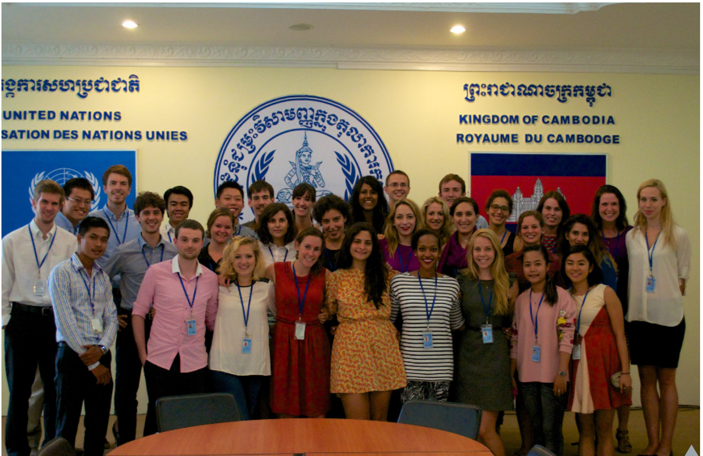
ECCC Interns, July 2014.

The UNAKRT internship programme offers recent university graduates and postgraduate students an opportunity to work in the unique environment of this hybrid tribunal in Cambodia. Here are a couple of stories from two interns in the Supreme Court Chamber and the Office of the Co-Prosecutors.