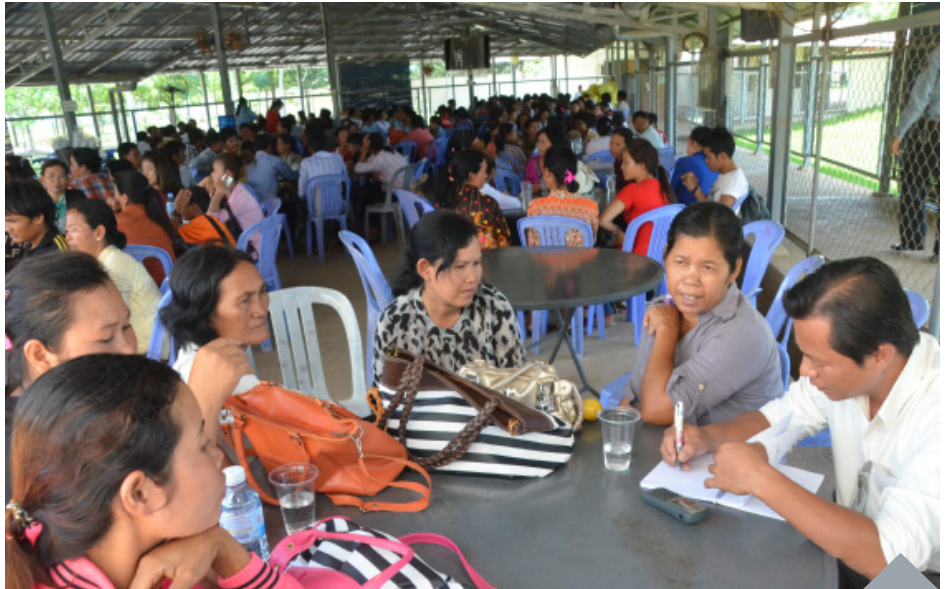
The ECCC welcomed 200 people from three different provinces on July 2014

"I really wanted to see the ECCC and am happy to see that the court exists. This court will bring justice for the victims and will also reveal why and how the Khmer Rouge identified the 'traitors'. Justice is rising. I have lost two family members. If I could ask the Khmer Rouge leaders anything, then I would ask: why did you kill your own people?"