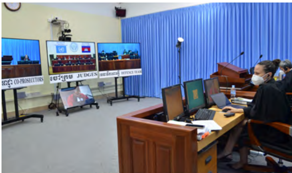
Civil Party Lead Co-Lawyers follow appeal proceedings. Audio-visual infrastructure (cameras, screens, microphones and infrared repeaters) which enabled hearings to take place during the Covid-19 pandemic is visible.

With the outbreak of the Covid-19 pandemic, the Extraordinary Chambers implemented risk minimization measures which were in line with Cambodian regulations. From 23 March 2020 through 30 November 2020, personnel worked remotely from their homes in Phnom Penh. Alternate work arrangements were reinstated following a community outbreak of Covid-19 on 20 February 2021 and continued through 14 March 2022.