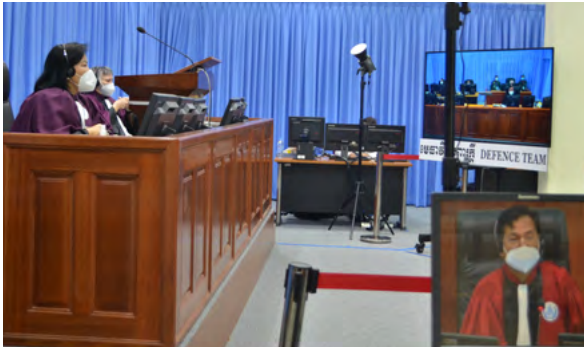
Co-Prosecutors follow appeal proceedings in Case 002/02 from the ECCC's second courtroom, which was adjusted to permit hearings to take place safely during the Covid-19 pandemic.