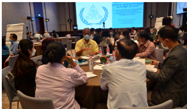
Victims participate in group discussions at the workshop on victim.

The workshop marked the first step of the consideration and implementation of the residual mandate of the ECCC.