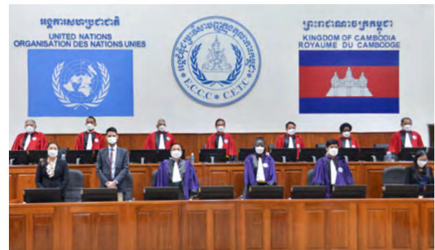
Pronouncement of appeal judgment in case 002/02 by the Supreme Court Chamber.