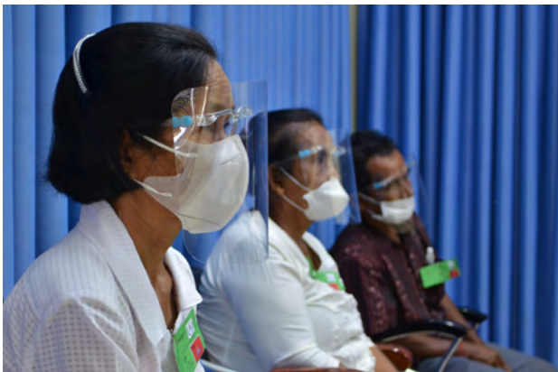
Civil parties attend appeal hearings in Case 002/02 in August 2021.