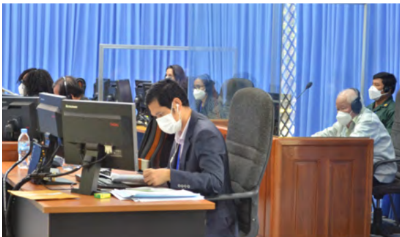
Khieu Samphan (R) and his defense team participate in appeal proceedings in Case 002/02.