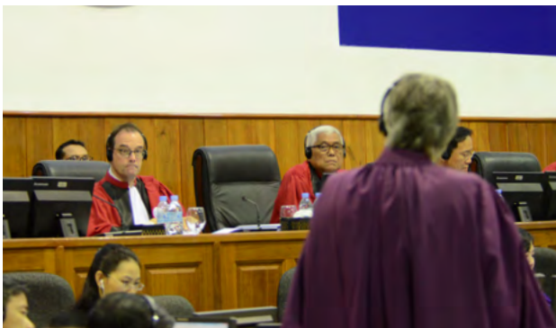
Submissions before the Pre-Trial Chamber in Case 003.