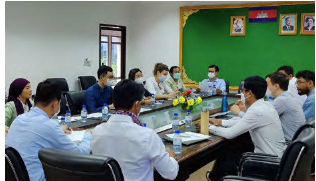
Constitutive meeting of a working group of victim-survivor-centered civil society organizations and the ECCC on 8 September 2022.

The meeting resulted in tangible outcomes for the setting up of the new working group, including plans for a secretariat led by civil society organisations and the ECCC.