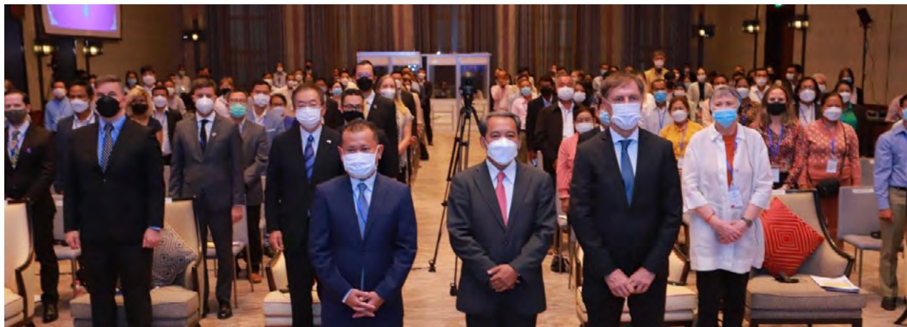
Opening day of Victims Workshop on 3 May 2022.