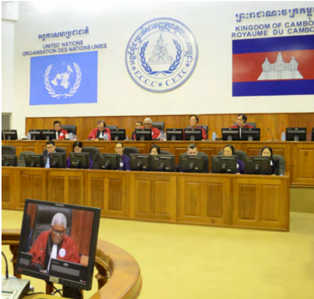
The Pre-Trial Chamber holds a hearing on the appeals against the closing orders in case 003 (27-29 November 2019).