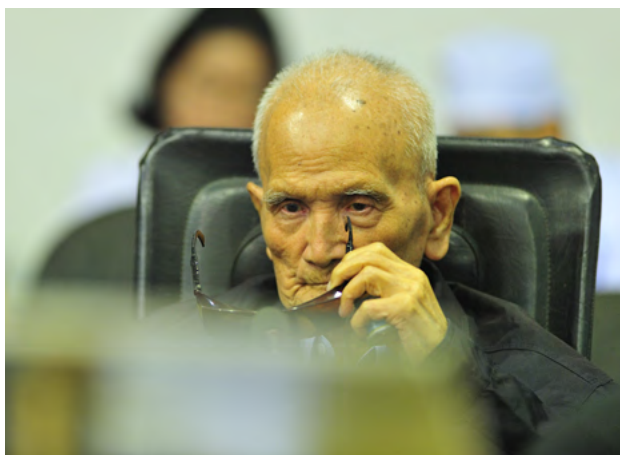
Nuon Chea at the pronouncement of the trial judgment in case 002/02.

The Trial Chamber sentenced Nuon Chea and Khieu Samphan to life imprisonment, merging the final sentences in Cases 002/01 and 002/02 into a single term of life imprisonment. The Trial Chamber notified the full written judgment on 28 March 2019.