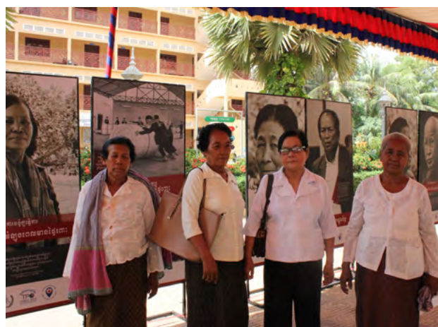
Civil Parties attend a mobile exhibition on Khmer Rouge victims in Siem Reap province.