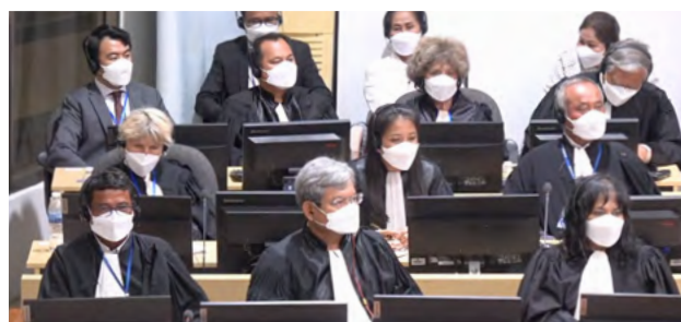
Civil Party Lead Co-Lawyers (front C and R), Civil Party Lawyers, legal team (front L and behind) at the pronouncement of the appeal judgment in case 002/02. Two (of five) civil parties inside the courtroom are visible.