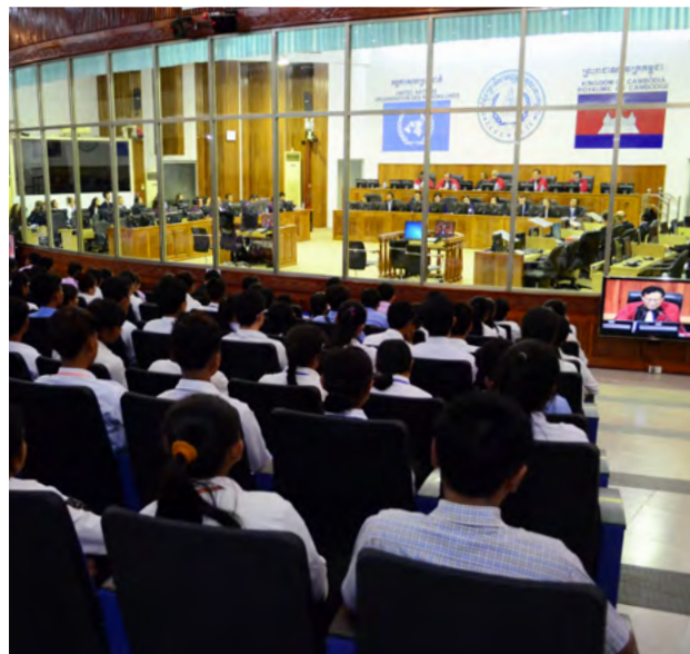
Public attends hearings in the appeals against the closing orders in Case 004/02.

The next edition of the Court Report will review these decisions and discuss their impact on the applicants and applications.