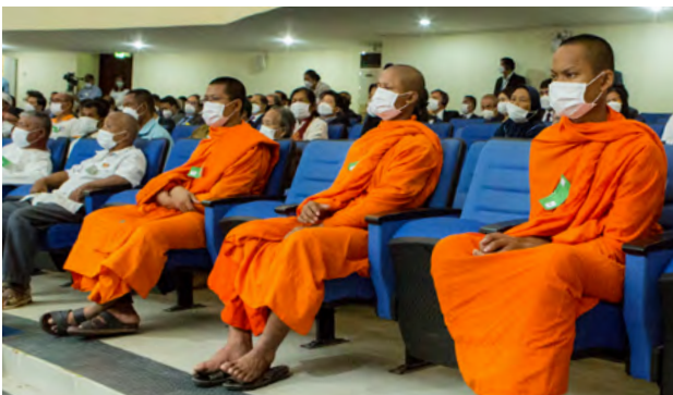
Monks attend the pronouncement of appeal judgment in case 002/02.

In January 2021, the Supreme Court Chamber scheduled appeal hearings in Case 002/02 for 17-21 May 2021. However, due to the Covid-19 pandemic, the Chamber rescheduled the hearings for August 2021. The appeal hearings were held in a hybrid (in-person and remote) and Covid-19 safe modality on 16-19 August 2021. The Chamber pronounced its judgment on 22 September 2022 (see lead article).