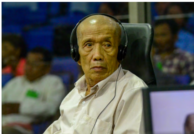
Duch's last appearance as a witness before the ECCC in Case 002/02 on 27 June 2016.