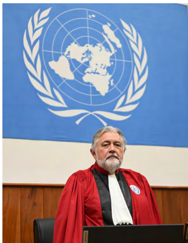
Supreme Court Chamber Judge Phillip Rapoza.