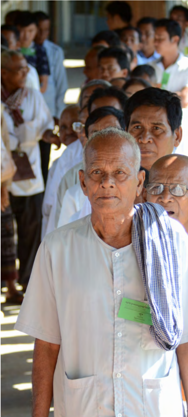
Members of the public line up to attend a hearing in November 2019.

on 27 February 2020 after receiving an extension of time and page limits. He argued, inter alia, that the trial was based on out-of-scope evidence, that the Trial Chamber had a partial approach to evidence and committed various errors in respect of such evidence, that the principle of legality had been breached, that individual responsibility had not been proved, and that there were errors of fact regarding Khieu Samphan's roles and his knowledge of the crimes.