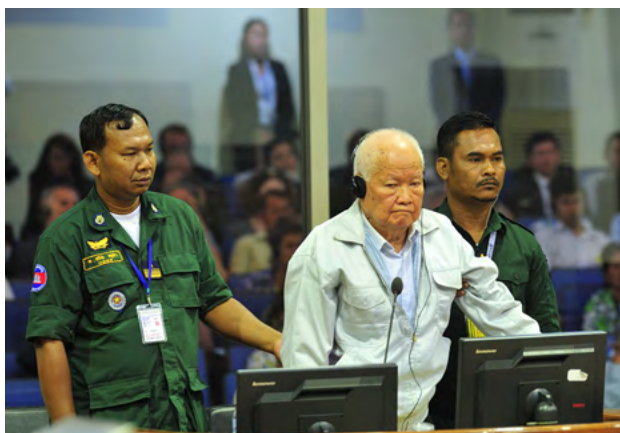
Khieu Samphan stands as the Trial Chamber pronounces the judgment in Case 002/02 on 16 November 2018.

On 19 November 2018, Khieu Samphan filed an urgent appeal against the Trial Judgment, requesting the Supreme Court Chamber to annul the summary delivered on 16 November 2018 for lack of form, and to declare the Trial Judgment invalid. The Supreme Court Chamber found the urgent appeal to be inadmissible.