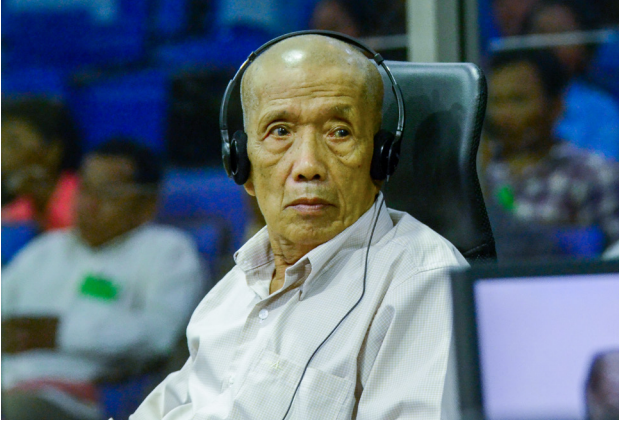
Duch's last appearance as a witness before the ECCC in Case 002/02 on 27 June 2016.