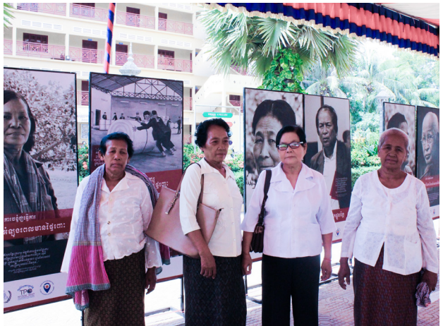
Civil Parties attend a mobile exhibition on Khmer Rouge victims in Siem Reap province.