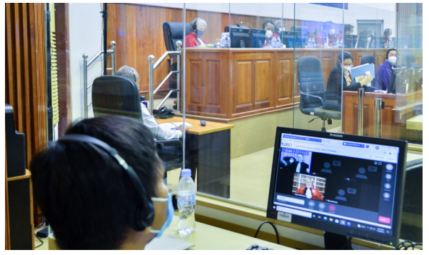
Reserve Judge Philip Rapoza (visible on screen) follows appeal hearings in Case 002/02 remotely in August 2021. Covid-19 prevention measures inside the courtroom are visible.

Chambres extraordinaires au sein des tribunaux cambodgiens