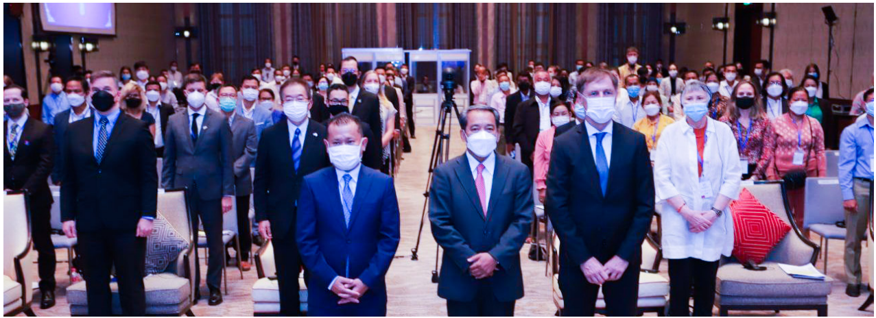
Opening day of Victims Workshop on 3 May 2022.