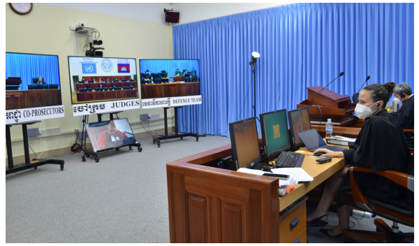
Civil Party Lead Co-Lawyers follow appeal proceedings. Audiovisual infrastructure (cameras, screens, microphones and infrared repeaters) which enabled hearings to take place during the Covid-19 pandemic is visible.