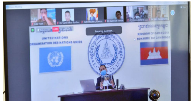
Chief of the Public Affairs Section, H.E. Neth Pheaktra, briefs journalists and media representatives via Zoom.

As usual, a public live stream was made available online, while the seats in the ECCC's public gallery were reduced from full capacity of about 550 seats to 50 (10 civil parties, 15 media representatives, 10 members of the general public and 15 diplomats and government representatives). Thanks to these and other risk mitigating measures (such as mandatory sanitization and face coverings, non-touch body heat scanners and access cards), no Covid-19 related infections were recorded.