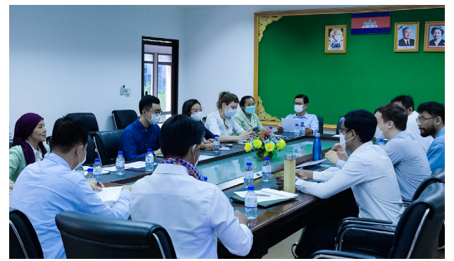
Constitutive meeting of a working group of victim-survivor-centered civil society organizations and the ECCC on 8 September 2022.

The meeting resulted in tangible outcomes for the setting up of the new working group, including plans for a secretariat led by civil society organisations and the ECCC.