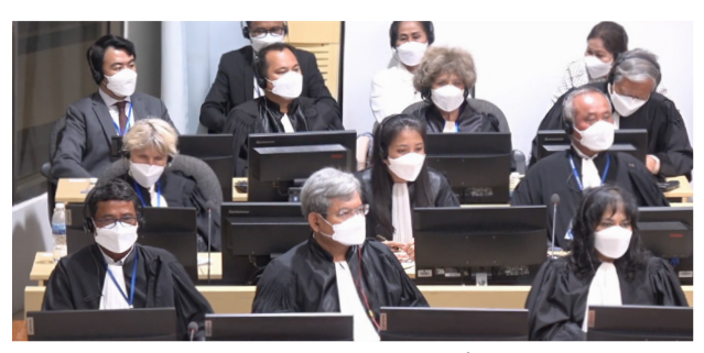
Civil Party Lead Co-Lawyers (front C and R), Civil Party Lawyers, legal team (front L and behind) at the pronouncement of the appeal judgment in case 002/02. Two (of five) civil parties inside the courtroom are visible.