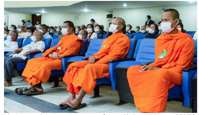
Monks attend the pronouncement of appeal judgment in case 002/02.

In January 2021, the Supreme Court Chamber scheduled appeal hearings in Case 002/02 for 17-21 May 2021. However, due to the Covid-19 pandemic, the Chamber rescheduled the hearings for August 2021. The appeal hearings were held in a hybrid (in-person and remote) and Covid-19 safe modality on 16-19 August 2021. The Chamber pronounced its judgment on 22 September 2022 (see lead article).