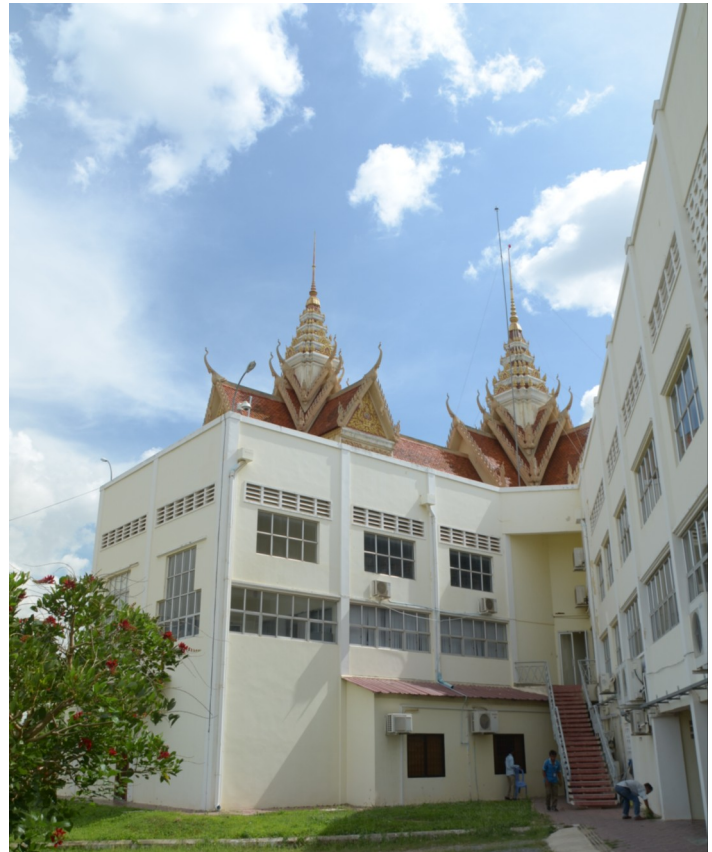
An external view of the ECCC court building.

26-29 June: Kdei Karuna conducts community celebration activity in Prey Veng province to celebrate with both local authorities and villagers the stupa created through the community memory initiative.