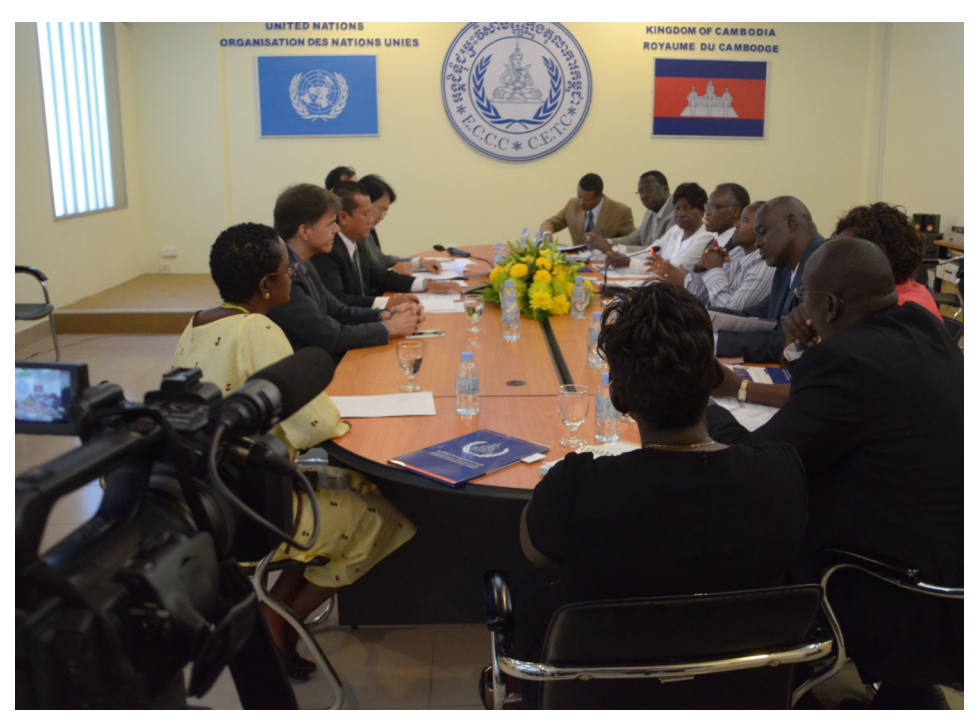
The Kenyan delegation meets with ECCC officials.

In an effort to learn from experiences in the prosecution and trial of international crimes at a hybrid court, a judicial delegation of Kenya visited the Extraordinary Chambers in the Courts of Cambodia on 27-30 May to hold a series of meetings with the court officials.