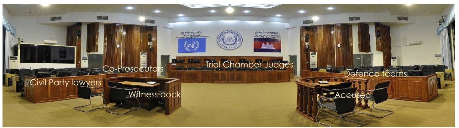
A panoramic view of the main courtroom in the Extraordinary Chambers in the Courts of Cambodia.

For an updated hearing schedule, visit http://www.eccc.gov.kh/en/event/court-schedule