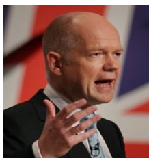
British Foreign Secretary William Hague

The United Kingdom has pledged a new contribution of £1,400,000 (approximately US$2.2 million) to the international component of the Extraordinary Chambers in the Courts of Cambodia, which is currently trying three senior leaders from the Khmer Rouge regime.