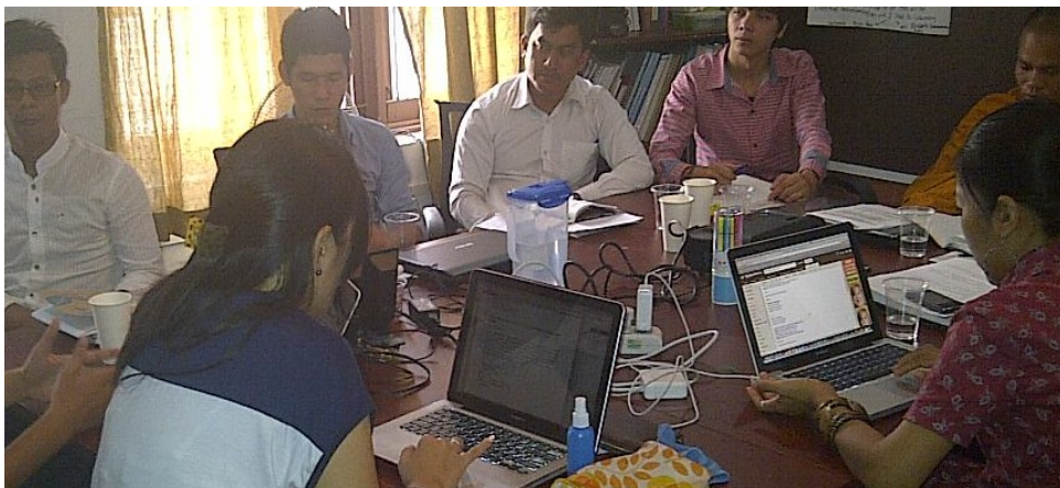
Cambodian law students undergo training for AIJI's Khmer Rouge tribunal monitor internship.

AIJI has been a leading monitoring group to observe trials at the ECCC and produce daily reports for the public since the ECCC's first case concerning Kaing Guek Eav, alias Duch.