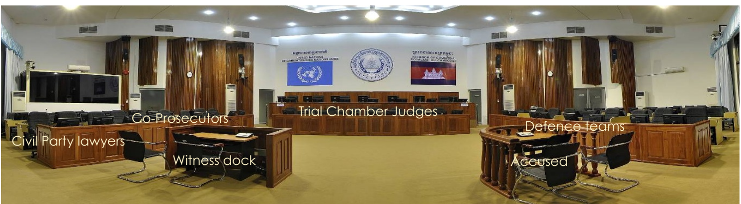
A panoramic view of the main courtroom in the Extraordinary Chambers in the Courts of Cambodia.