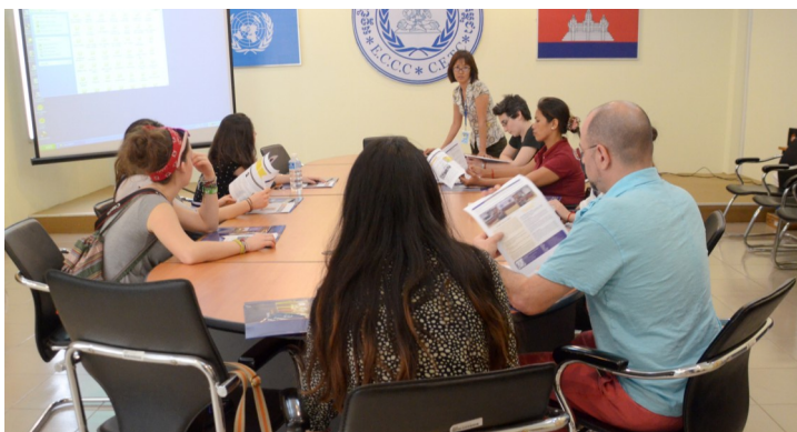
The Public Affairs Section hosts a group of American high school students.

20-22 March: Kdei Karuna screens a film on reconciliation for 20-30 villagers in Kratie.