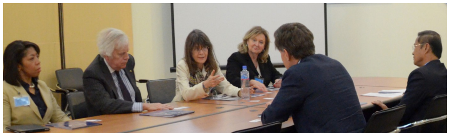
The co-investigating judges meet with members of the American Bar Association.

The delegation was in Phnom Penh for five days for diplomatic meetings with the Cambodian government and bar association leaders to discuss future cooperation.