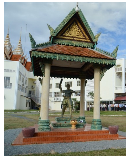
"The Lord of the Iron Staff" statue at the ECCC.