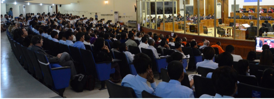
Members of the public attend a hearing in Case 002.

The Supreme Court Chamber of the Extraordinary Chambers in the Courts of Cambodia issued a ruling on 8 February invalidating a severance order issued by the Trial Chamber to sever Case 002 into smaller trials.