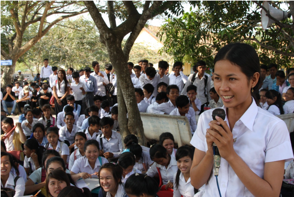
Students at Samdech Hun Sen High School attend a presentation by the ECCC's Public Affairs Section.

In an effort to reach out to Cambodian youth, members of the Public Affairs Section of the Extraordinary Chambers in the Courts of Cambodia traveled to Takeo Province on 15 February to educate high school students about the work of the court.