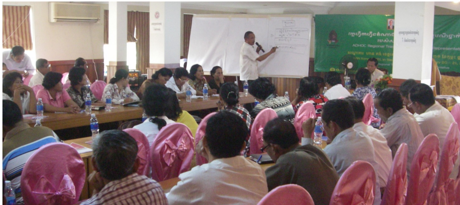
Victims' representatives and lawyers meet for training hosted by ADHOC in Siem Reap.

Many of the representatives stated that they understood that proper medical assistance must be given to the accused as elements of fair trial standards, but they found it difficult to understand why the victims are