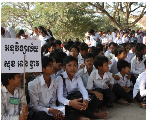
Students await the start of the presentation.

The students were further invited to participate in the court's study tour programme, which consists of guided visits to S-21, Cheung Ek Killing Fields and the ECCC. The court provides free transport for large groups of Cambodians.