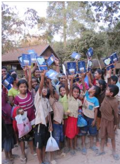
Doing outreach in the Rung Roeang District

In December, the unit received 54 calls from victims and interested persons to its helpline. During the first week after the TV and radio spot, a total of 105 calls reached