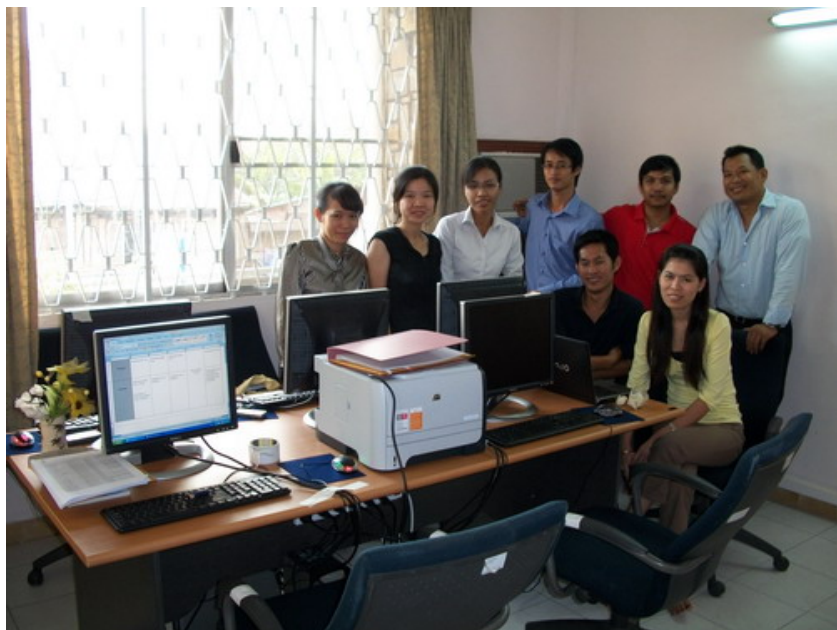
CJR members working with the Court Monitoring Program

The Center for Justice and Reconciliation (CJR), a new civil society organization partnering with the ECCC, advocates for Khmer Rouge survivors. Since it opened its doors in August 2009, CJR submitted over 130 civil party applications to the ECCC, organized a national conference on victims' participation, and facilitated the organization, registration and capacity building of the first nationally-based Association of Khmer Rouge Victims of Cambodia (AKRVC).