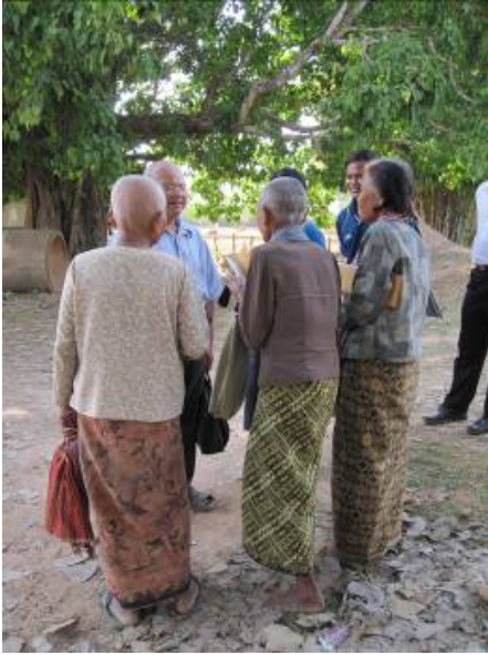
Complainants and Officials in Kampong Krabau

in the ECCC courthouse to inform Civil Parties and applicants to Case 002 of the role of Civil Parties and Complainants within the tribunal's legal process. During the two-day forum, the 300 participants also met with their lawyers in small groups to address their personal concerns. The forum was funded by the German government, and a number of NGOs such as TPO, ADHOC and DC-Cam also participated. (See related story on page 8)