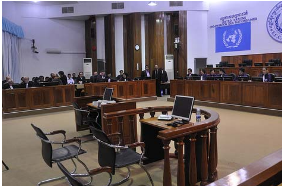
Computers and monitors during Kaing Guek Eav, Duch’s hearing. Technical support staff ensured the trial proceeded smoothly.

The ECCC is among the 10 winners of “Law Firm and Legal Department Awards” in the magazine’s seventh annual awards programme.