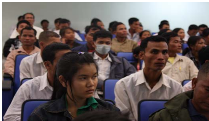
Villagers from Svay Rieng province listen to briefings in the courtroom

25 January 2010: A woman from Inwent- Capacity Building International came to the court to tour the facility. The non-profit organization is training journalists on how to report on the trial's proceedings.