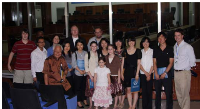
Handong International Law students pose in the courtroom