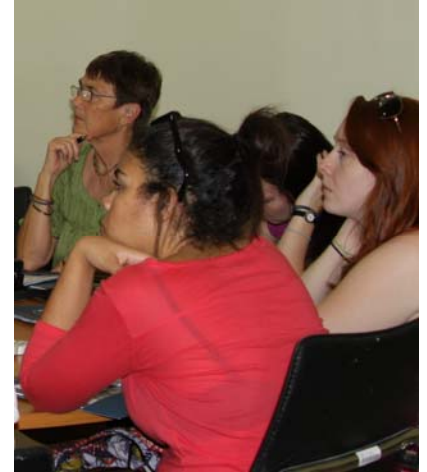
Eckerd College students attend a briefing by Public Affairs Officer