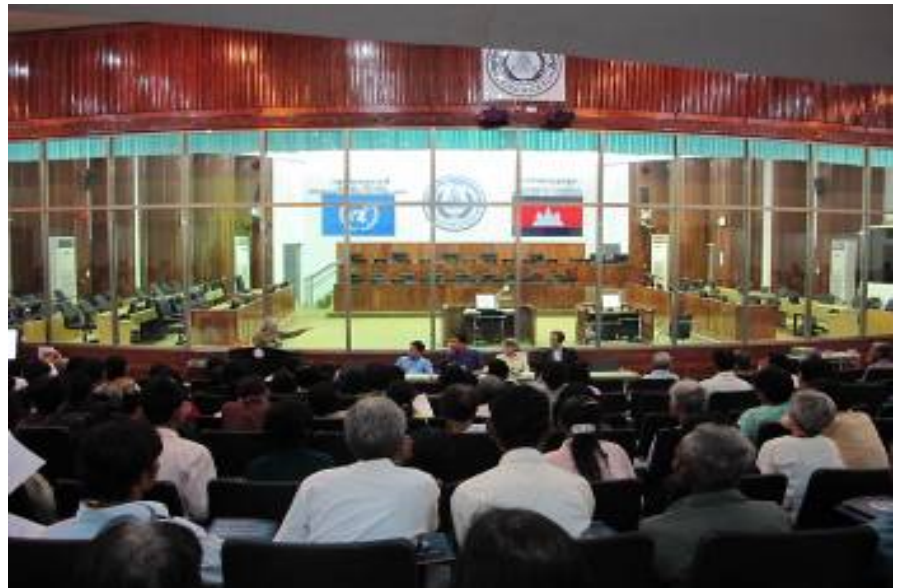
Civil Party Applicants in the Public Gallery of the ECCC

It continued to analyze the Case File and prepared Trial Readiness Assessment Reports (TRARs) to assess the requirements of making further investigative requests to the Co-