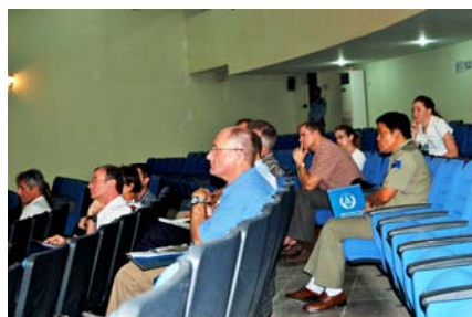
Delegates from the Australian Centre of Defence and Strategic Studies

In May, an American delegation from the National War College visited the tribunal as part of a wider regional trip. The Washington-based institution educates future leaders of the Armed Forces, State Department, and other civilian agencies for high-level policy, command, and staff responsibilities. The purpose of their Cambodia journey was to gain insight into the country’s foreign policy and defence strategies.