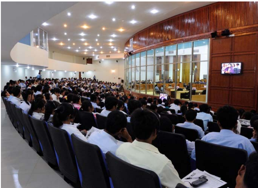
Not a single seat of the public gallery will remain empty on July 26 for the judgment in Case 001 against Kaing Guek Eav alias Duch (pictured right)