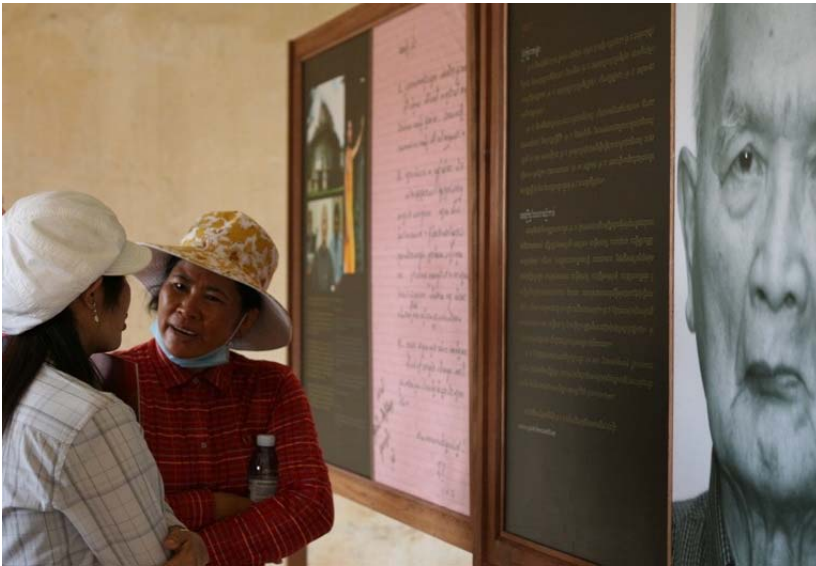
Visitors comment on Documentation Center of Cambodia's exhibit Genocide: The Importance of Case 002

In the lead-up to the verdict of S-21 prison chief Kaing Geuk Eav aka Comrade Duch on July 26, two intriguing exhibitions about the Khmer Rouge trials have recently launched in Phnom Penh.