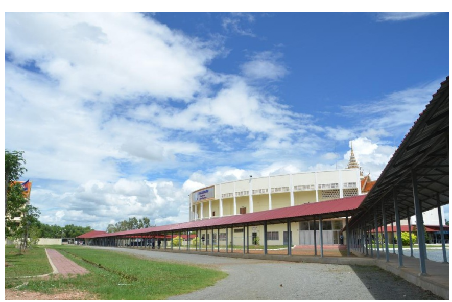
The ECCC court building (file photo)

In addition, a judge in the Pre-Trial Chamber who had been appointed as an administrative judge in respect of a nonfees dispute between a co-lawyer and the Defence Support Section issued his decision on 13 December. He found the colawyer's claim for the reimbursement of a flight ticket for his legal consultant inadmissible.