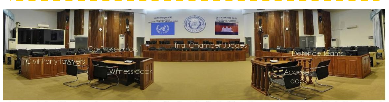
A panoramic view of the main courtroom in the Extraordinary Chambers in the Courts of Cambodia.

The court provides simultaneous interpretation of its proceedings in Khmer, English and French. The speakers in the main courtroom project the proceedings in Khmer, but English and French translation is also available through the headsets on either side of the main courtroom. English is on channel 2 and French is on channel 3.