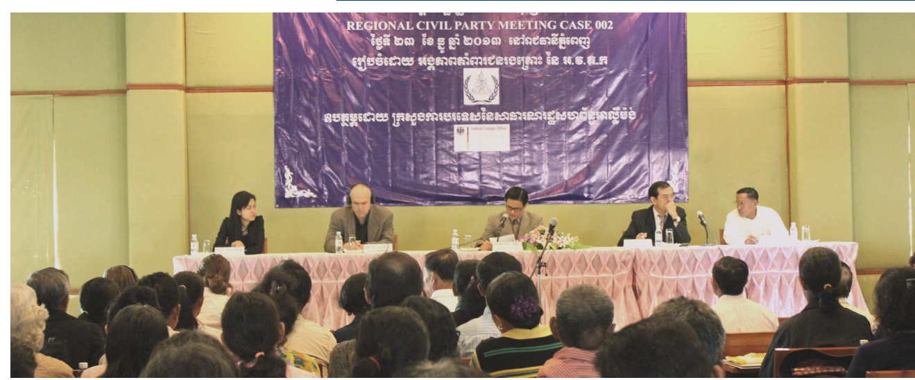
Officials of the Khmer Rouge tribunal meet with civil parties at the 8th Regional Civil Party Meeting in Phnom Penh on December 23.

party forum held in Phnom Penh where they updated civil parties on the status of proceedings and reparations in Case 002/01 as well as discussing plans for proceedings in Case 002/02. At the conclusion of this forum, the approximately 200 civil parties in attendance issued a press release calling on the Court "1) to deliver the judgment in Case 002/01 expeditiously and 2) to commence the evidentiary hearings in Case 002/02 as soon as possible in view of both our and the accused's age and health condition and the burden on stakeholders to finance the ECCC."