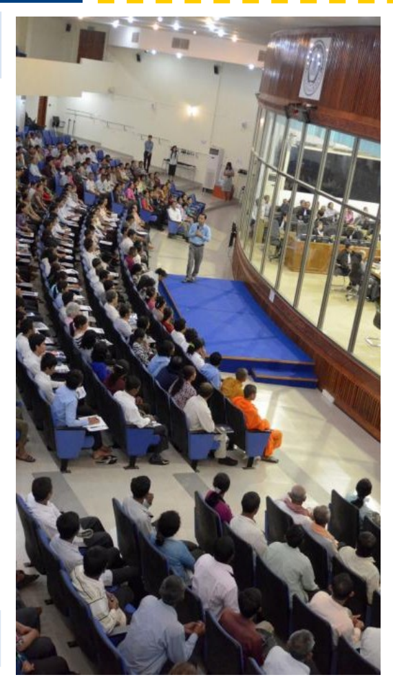
Hundreds of visitors attend a hearing. (file photo)

11 February 2014: Preparatory Hearings in Case 002/02