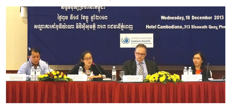
Representatives of the Extraordinary Chambers in the Courts of Cambodia and its partners discuss legacy projects at the ECCC Legacy Update Meeting on 18 December.

gramme consultant, described the agency's efforts in promoting a dialogue between Cambodian lawyers regarding ECCC legacy through workshops and roundtable events. She also reported on the Fair Rights Trials Academy, a short course for Cambodian law students which offers lectures by practitioners from the ECCC and the local justice sector.