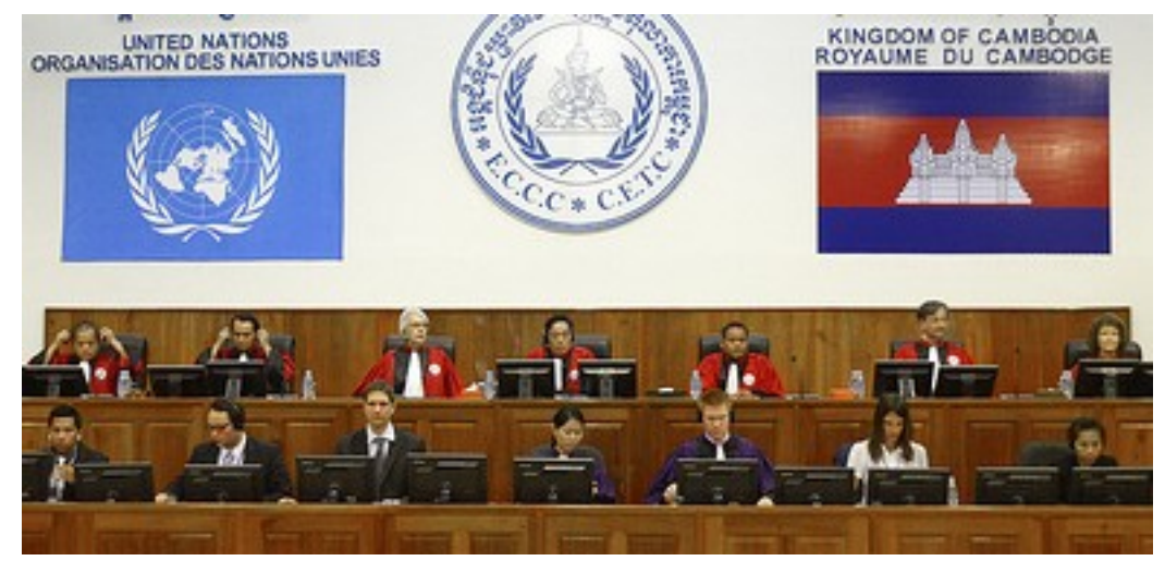
Judges of the Trial Chamber sit in the courtroom to hear evidence in Case 002. (File photo)