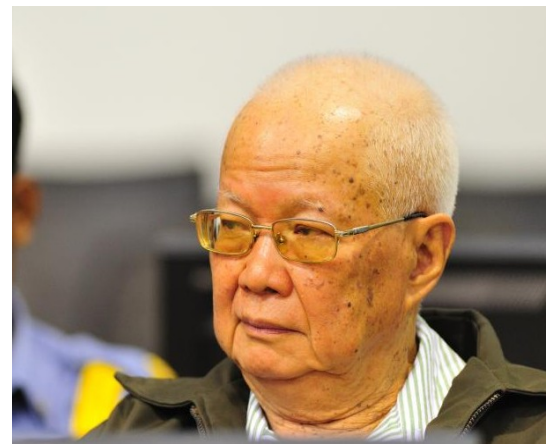
Nuon Chea, former deputy secretary of the Communist Party of Kampuchea (left), and Khieu Samphan, former head of state (right) both stand trial in Case 002.