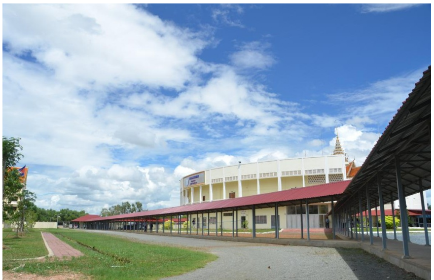
The ECCC court building (file photo)

These appeals are all classified as "confidential".