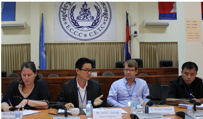
The Victim Support Section convenes a coordination meeting with its partners to discuss the implementation of reparation projects.

start of Case 002/02 until the final decision on all appeals had been made, emphasizing the lack of legal basis for such a position and the long wait for justice that civil parties have endured. They also argued in favour of the additional severance in Case 002, which would allow for the remaining allegations to be heard in smaller trials and increase the chances of additional judgments.