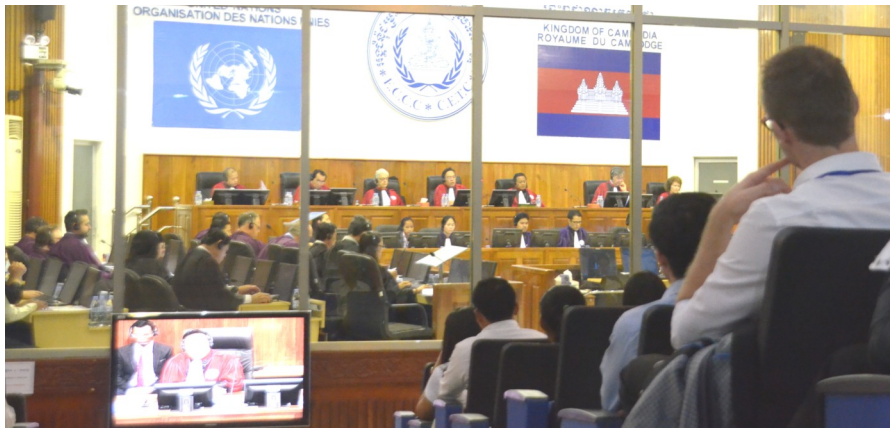
Visitors attend the adversarial hearing from the public gallery on 11 February.

During the hearing, counsel for Nuon Chea