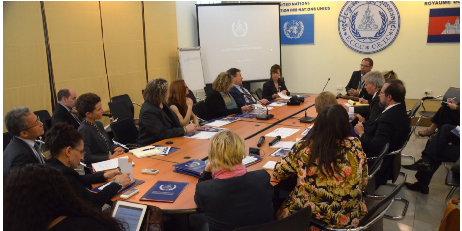
A delegation of the American Bar Association listens to a presentation on the workings of the hybrid court at the Extraordinary Chambers in the Courts of Cambodia.

The delegation received extended briefings about the functioning of the court and the current status of cases from representatives of the Public Affairs Section, the Office of Co-Prosecutors, the Civil Party Lead Co-Lawyer Section, the Defense Support Section and the International Co-