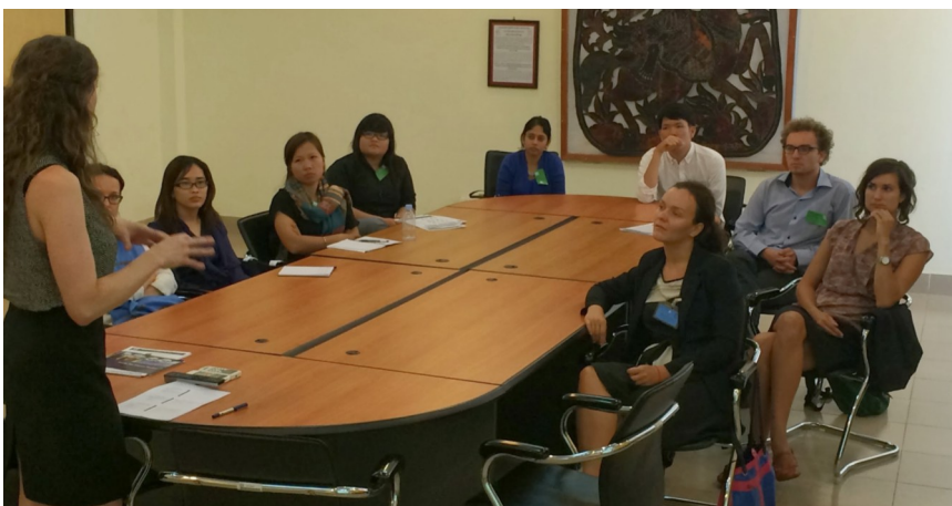
UN Volunteers receive a presentation from a legal consultant of the Defence Support Section.

The high school hosts the Brookline Cambodia Partnership, a charity to raise funds for a sister school in a rural Cambodia. It has sent six selected students every year to learn the complexities of Cambodian history and culture since 2012.