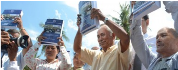
Civil Parties receive copies of Duch verdict in Case 001

The Victims Support Section (VSS) of the Extraordinary Chambers in the Courts of Cambodia has made an appeal to the public to raise more funds for the reparation projects proposed by civil parties to the Trial Chamber in Case 002/01. The appeal is made to qualify the proposed projects for recognition as reparations by the Trial Chamber in case of the conviction of the accused persons. The Civil Party Lead Co-Lawyers are required to submit proof of secured funding, authorizations and other project details by 31 March. Here is the list of the 13 projects and their current funding status.