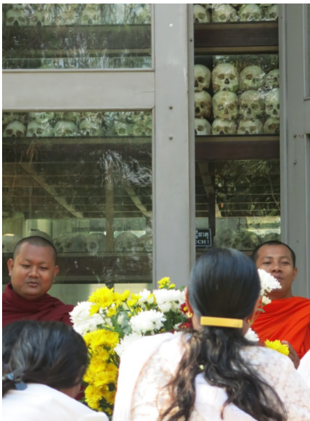
Monks and civil parties pray for souls in front of the Stupa in Choeung Ek killing fields during the Buddhist ceremony.