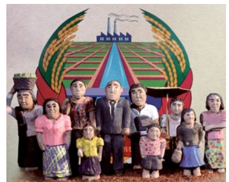
Clay figures are used in The Missing Picture.

Rithy Panh has also founded and directs the Bophana Audiovisual Resource Centre, which has jointly conducted the ECCC's community video screenings across Cambodia.