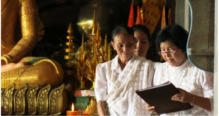
A civil party has her written testimony read by another participant during a Buddhist ceremony of testimonial therapy.

The Transcultural Psychosocial Organization (TPO) organized the ceremony in cooperation with the ECCC's Victims Support Section and the Cambodian Defenders