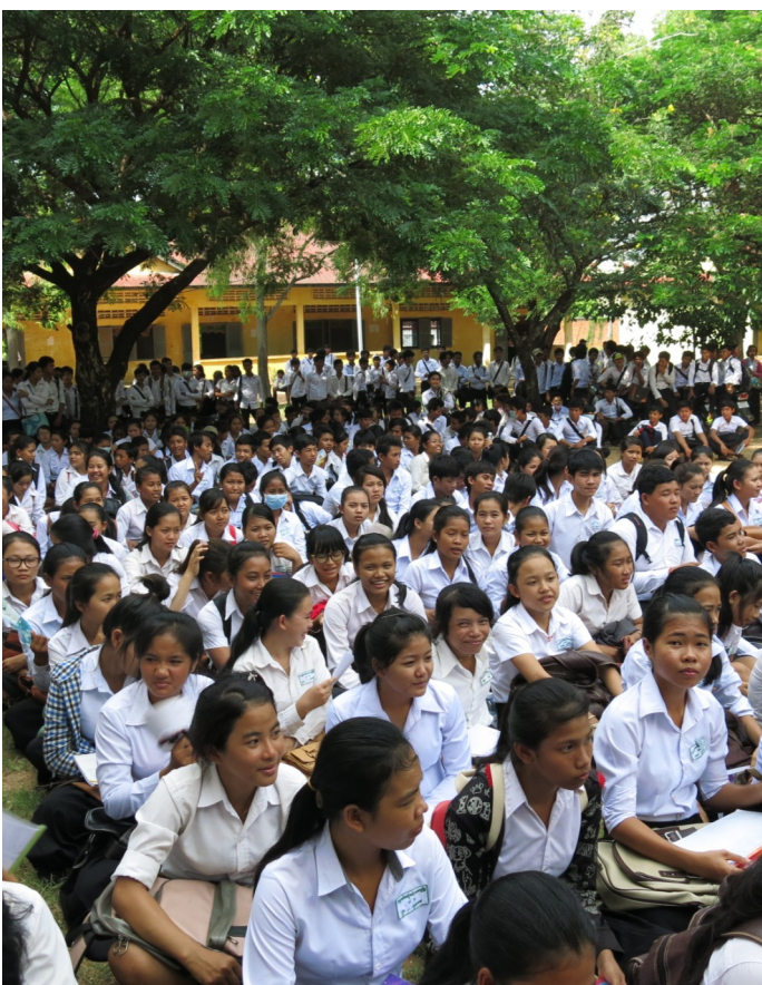
Students listen to a presentation during an ECCC outreach activity in their high school in Kampong Thom.

13 March: The Victim Support Section organizes a Civil Party Forum in Kampong Cham with partners NGOs to discuss the reparations. Guest-speakers include representatives of the Victim Support Section, the Public Affairs Section, the Office of the Co-Prosecutors, the Civil Party Lead Co-Lawyers Section, as well as representatives from Youth for Peace, the Transcultural Psychosocial Organisation, and Cambodian Defenders Project.