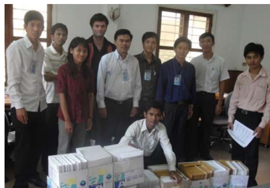
VSS processing team in front of the Civil Party Applicants

In addition, outreach staff provided information to Civil Party applicants and answered their questions regarding court procedures in public forums, one at the Court's premises organised by the Public Affairs Section addressing as many as 300 Civil Parties from Kratie, and a second forum in Anlong Veng, organized by one of the Court's partner organisations, the Centre for Justice and Reconciliation. Upon application by Civil Party lawyers noting the need for legal advice to applicants in this respect, the Co-Investigating Judges extended their deadline for this purpose to 30 June. As a result, this campaign will continue in