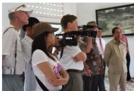
Former correspondents tour the Tuol Sleng Museum