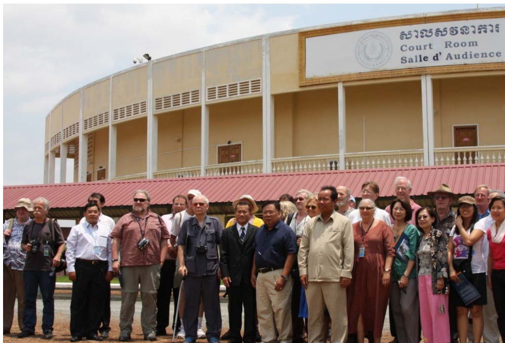
Former war correspondents who covered Cambodian civil conflict and beyond in the 1970s visit the court in part of their first reunion in Cambodia

former colleagues. "We are living history of that period."