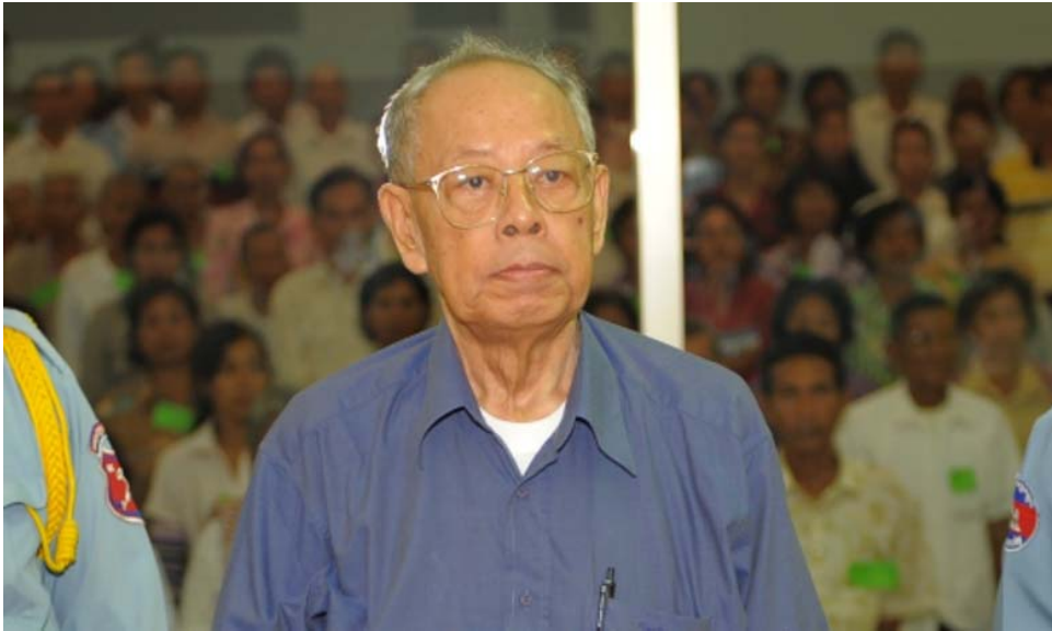
Charged person leng Sary appears before the Pre-Trial Chamber on 30 April 2010

The Pre-Trial Chamber of the Extraordinary Chambers in the Courts of Cambodia (ECCC) on 30 April dismissed appeals lodged by the charged persons leng Sary, Khieu Samphan and leng Thirith against three orders extending the periods of their respective provisional detention.