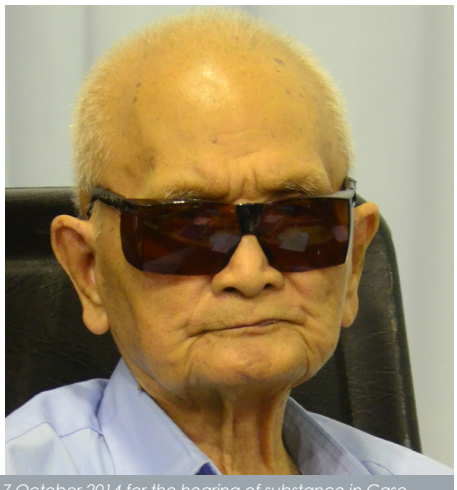
hieu Samphan (Left) and Nuon Chea in the courtroom on 17 October 2014 for the hearing of substance in Case 02/02.