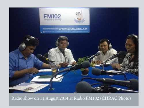
8 Sept 2014: CHRAC and Radio FM 102 produced a KRT Watch Radio Call-in Show with a theme: the ECCC's progress after delivering the verdict in Case 002/01. The outcome was increased public awareness of the ECCC's progress after delivering the verdict in Case