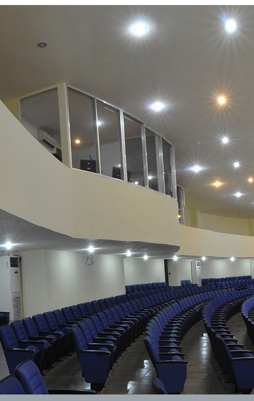
ECCC courtroom after the public attended the judgement hearing of Case 00

On 9 September 2014, the Pre-Trial Chamber notified the Decision on an Appeal filed by a suspect in Case 003 against the alleged "constructive denial" by the Co-Investigating Judges of a Request to get access to the case file. Considering the grounds on which the Appeal was filed and the relief requested and noting that the International Co-Investigating Judge is in the process of actively considering the Request, the Pre-Trial Chamber found that the argument that the Request is constructively refused fails and decided to dismiss the Appeal without prejudice to any further rights.