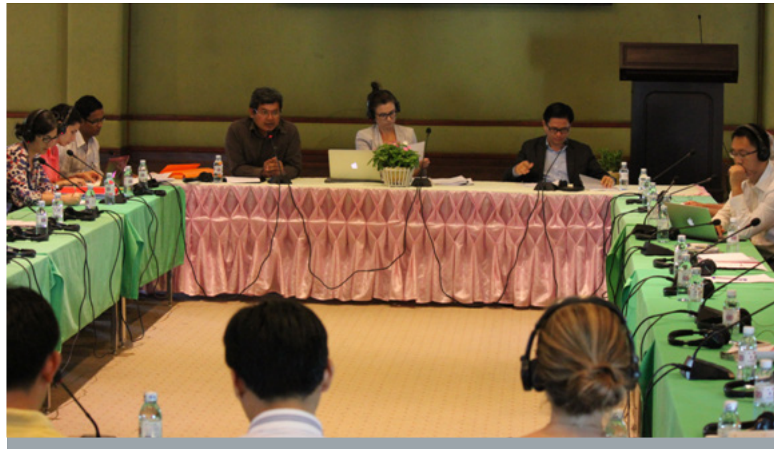
Stakeholder Consultation on Case 002/02 reparation.

upcoming deadline for the Case 002/02 document list. On 16 May 2014, the Co-Prosecutors filed a response to the Khieu Samphan Defence team's appeal of the Trial Chamber's severance order for Case 002/02. The Co-Prosecutors have also continued to do the necessary work to fulfil their ongoing disclosure obligations in Case 002.