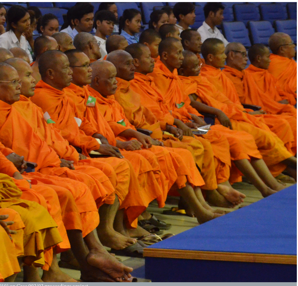
919) on Case 002/02 proceedings against

dural motions. The Analysts Unit assisted and participated in all field missions carried out during this period. They also assisted legal officers in alaysing Khmer language documents and DK contemporaneous documents.