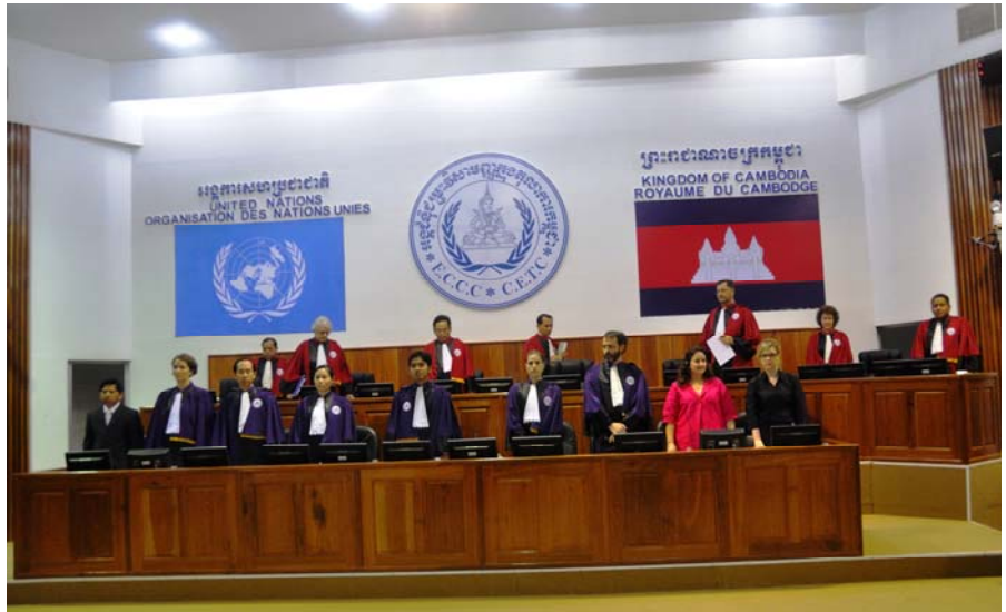
Trial Chamber Judges enter the courtroom on 26 July to pronounce their verdict in Case 001

In Duch's trial, which began in March last year and wrapped up in November, 55 witnesses including 22 civil parties were heard. In total, 31,349 visitors attended the hearings during that period.