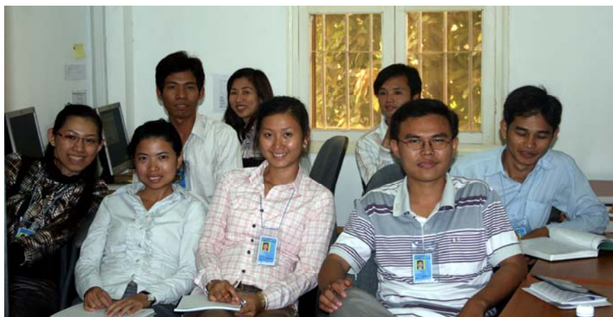
Several new staff members joined the Victims Unit last month.

These new colleagues will help the Victims Unit to comply with its comprehensive mandate. The Victims Unit will be able to accelerate the processing of complaints as well as Civil Party applications and to extend its outreach activities in order to inform Victims about their rights.