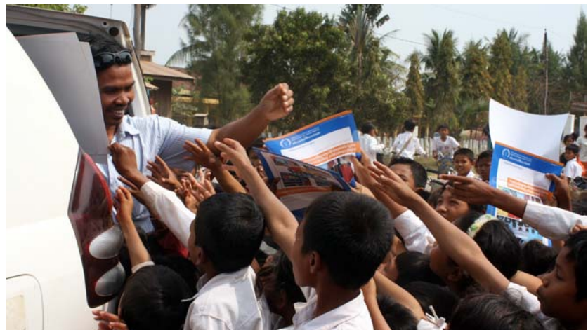
Outreach in Pursat province.

During the Pursat outreach mission, two civil party applications were received and forwarded to the Victims Unit. Local people and authorities expressed their wish to join the ECCC proceedings. Although sometimes they are concerned about their capability of filling up the information form and sending it to the Victims Unit, these matters were explained carefully.