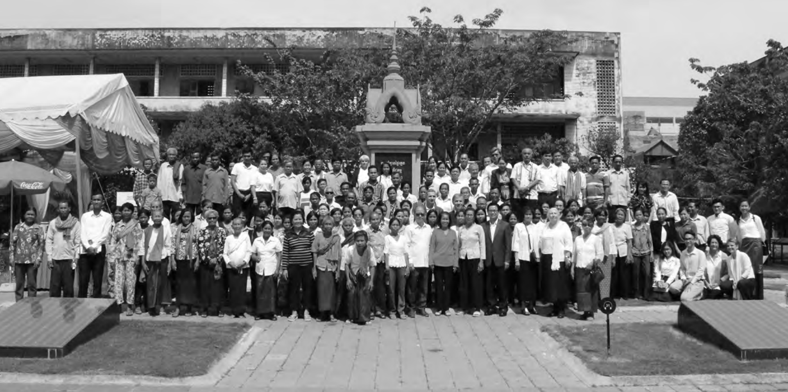
Survivors of the Khmer Rouge regime and Civil Parties attend a 20 May Remembrance Day commemoration at the Tuol Sleng Genocide Museum.

initial period for the residual functions is envisaged as being three years; and that possible target groups of the initiatives might include, but are not limited to, direct victims and their descendants, teachers, domestic and international students and academics of various disciplines, the general public, and the media.