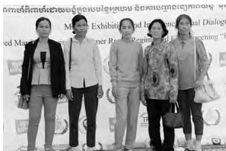
Civil Parties attend a mobile exhibition on victims of the Khmer Rouge regime in Siem Reap.

ensure the safety of witnesses who testified in Special Court trials.