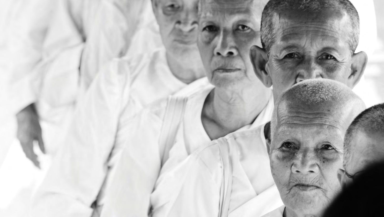
Nuns line up at the ECCC to attend hearings in Case 002/01.

“It would appear therefore that the residual phase of a court commends itself both to contributing to the victims’ healing process and the wider aspiration of national reconciliation.”