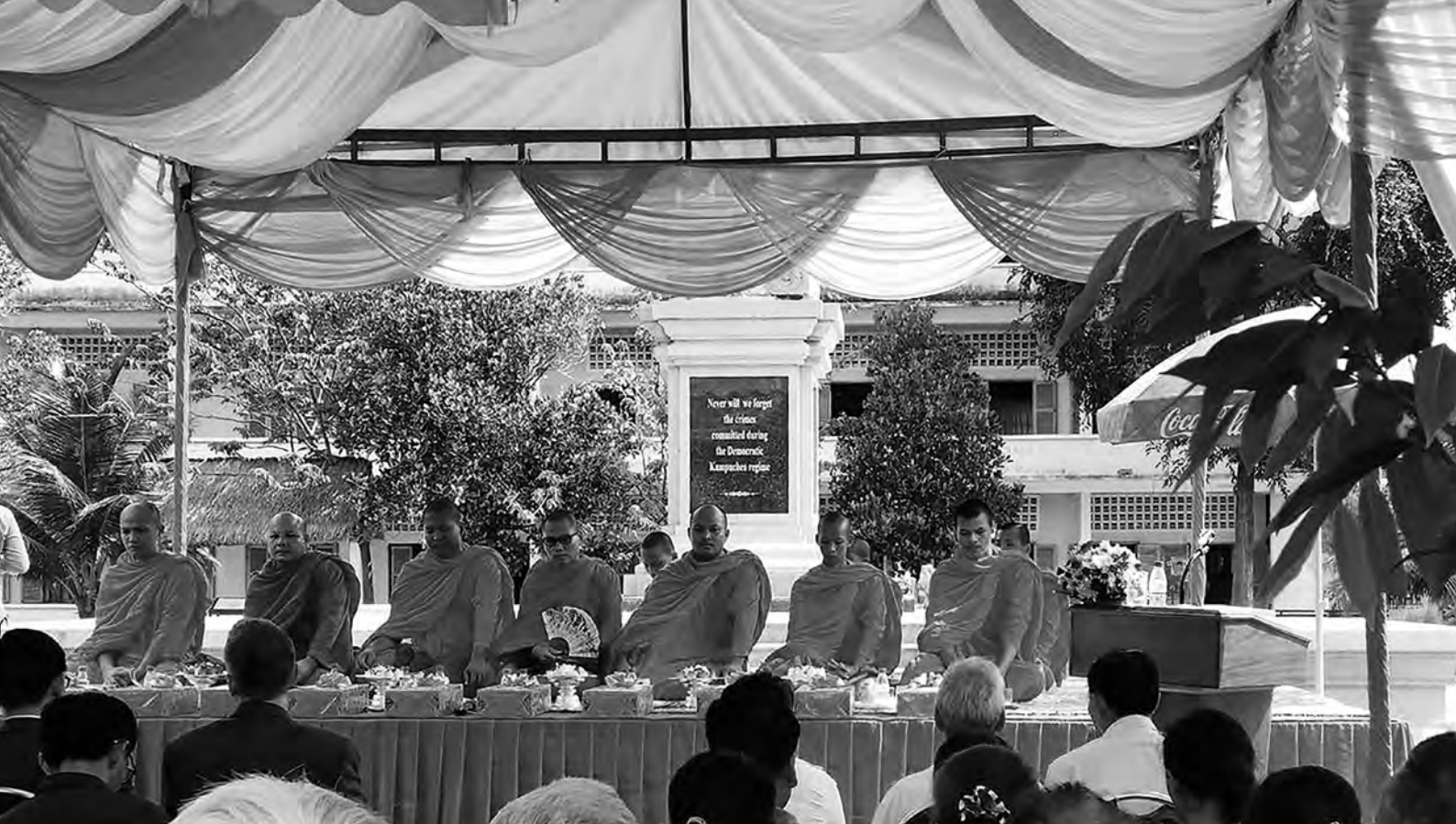
Monks give blessings to survivors of the Khmer Rouge regime and Civil Parties at the 20 May Remembrance Day commemoration held at the Tuol Sleng Genocide Museum.

Not covered by any proposal yet but worth considering in our view is the development of victims support services within the national criminal law system. These include services especially, though not exclusively, for victims of sexual crimes and minorities including legal, financial and psychological support.