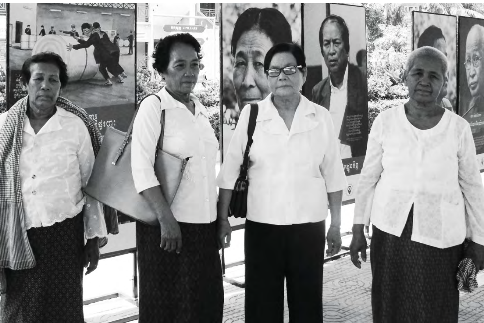
Civil Parties attend a mobile exhibition on victims of the Khmer Rouge regime in Siem Reap.

Further still, it is necessary because support for victims – and even more so national reconciliation – call for a more holistic approach to the conflict than a criminal trial can provide. Every member of society was quite literally impacted at the time of the conflict which is under the jurisdiction of the court, and whose consequences were felt long thereafter and still reverberate today. Half of the current population of Cambodia was not born at the time of the Khmer Rouge regime but are impacted by living with the trauma their parents,