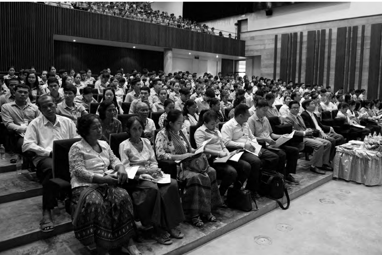
Civil Parties attend a mobile exhibition on victims of the Khmer Rouge regime in Siem Reap.

International Tribunal for the former Yugoslavia, the International Tribunal for Rwanda, the Extraordinary Chambers in the Courts of Cambodia, and the Special Tribunal for Lebanon, the Office of the Prosecutor has worked to document the recommended practices from each prosecutorial office. The project consulted widely with current and past members of the various OTPs, including current and former prosecutors, and resulted in a best practices manual to assist investigators and prosecutors at the international level, as well as relevant national prosecuting authorities.