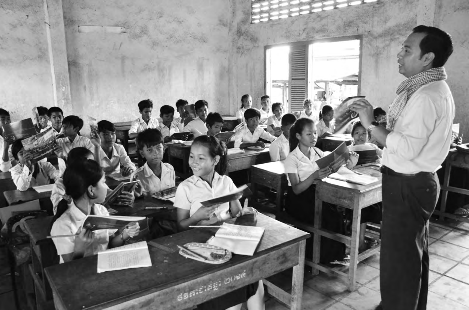
Students in Anlong Veng School receive a briefing from the Public Affairs Section on developments at the ECCC.

stakeholders and donors but also one with the media, which can play an important role in presenting the initiative and the underlying concept to the public. Wider knowledge of the initiative might also assist with fundraising. Even though contacted, we have not yet engaged with the media to not prejudice further developments at what is the inception phase of this initiative.