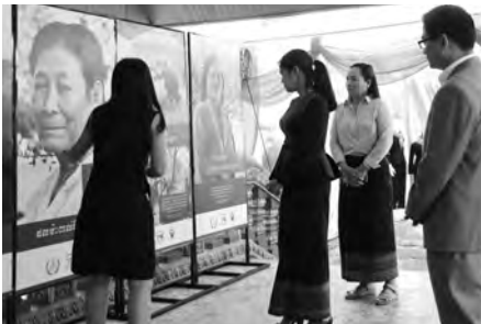
Koh Kong Provincial Governor receives a briefing about forced marriage under the Khmer Rouge.